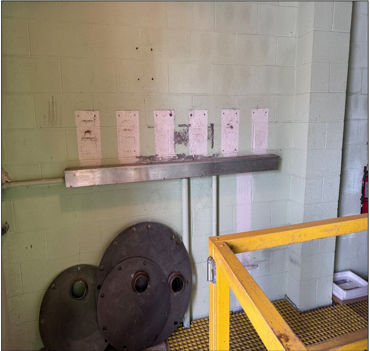
Figure 2 – Removed Electrical Disconnects from Flushing Chamber A