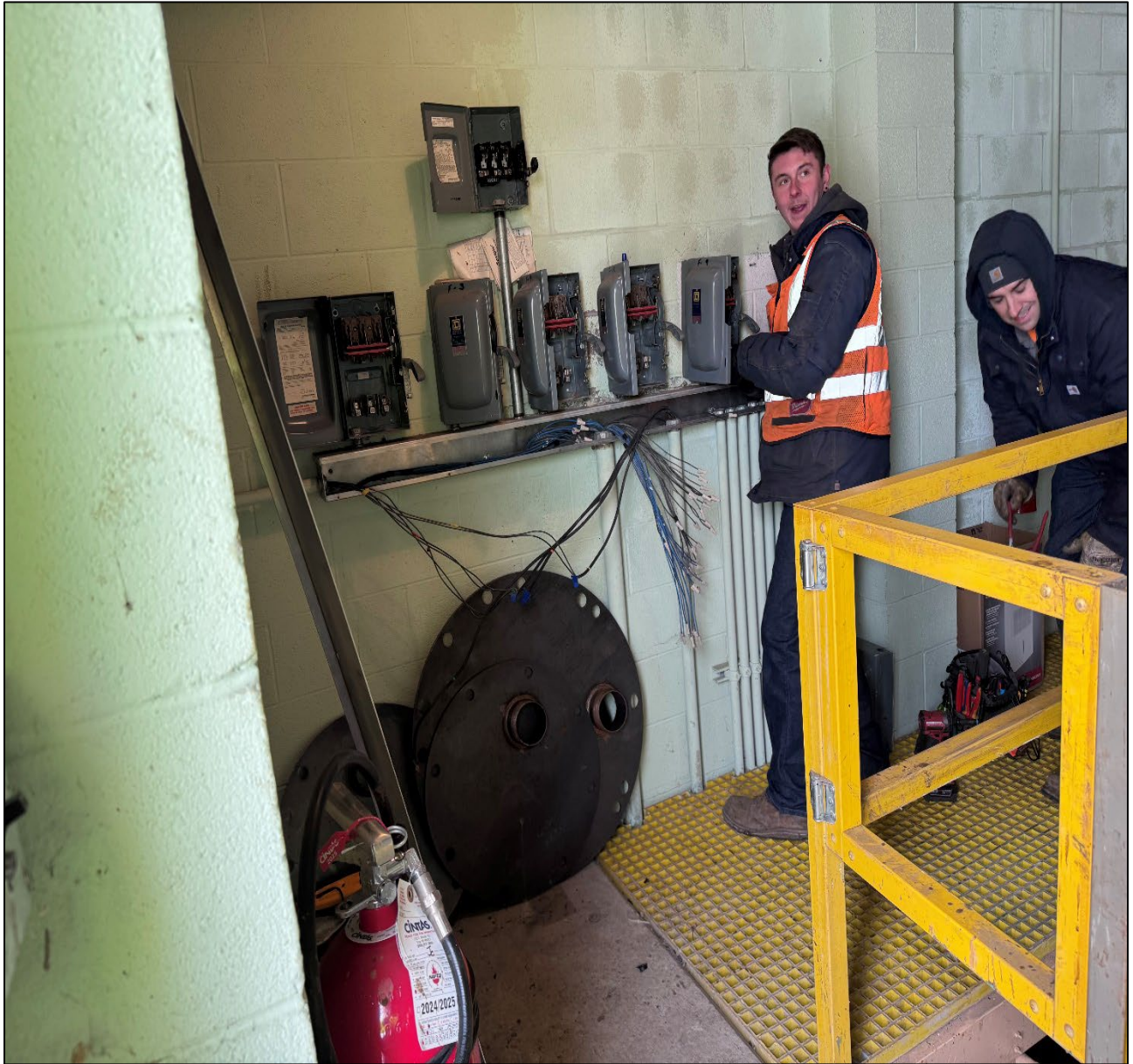
Figure 1 – Removing Electric Disconnects from Flushing Chamber A

Macomb County Public Works Commissioner Candice S. Miller