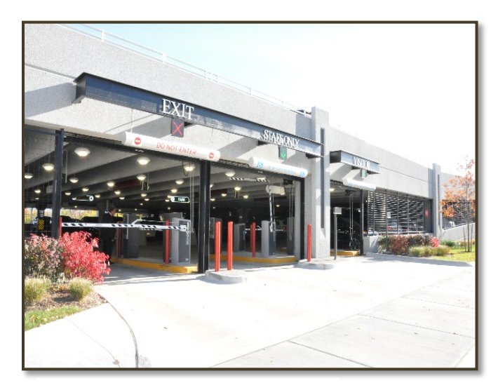
Parking structure southbound Main St

PARK AND RIDE - You can park and ride a shuttle bus through Mount Clemens Dial a Ride for $1 each way that will drop you off on North Main Street between the Court and County Buildings. The shuttle bus parking lot is located on North River Road (across from "Clinton River Cruises").