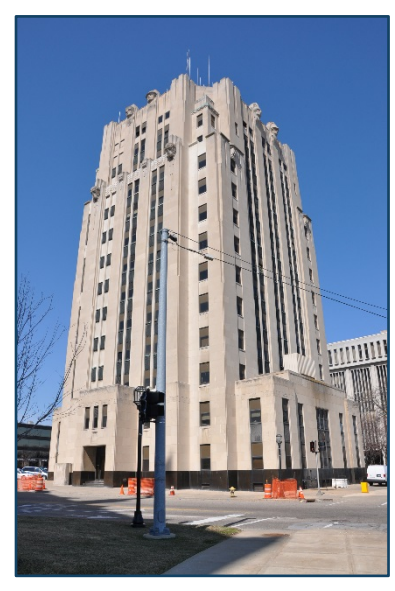
Old County Building

The Macomb County Friend of the Court is located on the 1<sup>st</sup> through 7<sup>th</sup> Floors of the Old County Building which is at 10 North Main Street, Mount Clemens, Michigan 48043. All visitors must enter the building at the Main St side or via the basement level tunnel from the Court Building or the Administration Building. If you park in the parking garage you will enter the Administration Building and can walk the basement tunnel to the Old County Building. Please check in with reception on the 2<sup>nd</sup> floor unless you are only coming in to make a payment. Payments may be made on the 1<sup>st</sup> floor at the Cashiers Office.