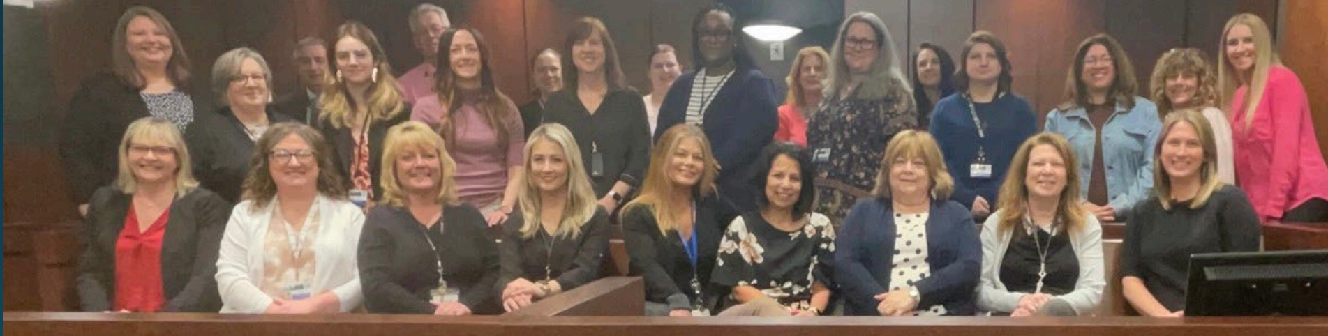
Court staff as of April 2022