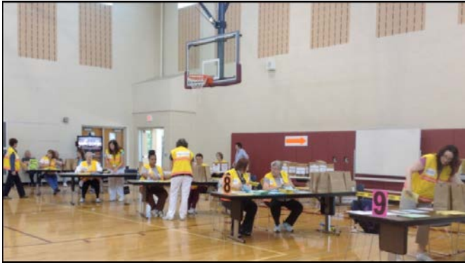
Warren Mott High School Dispensing Site

Macomb County Health Department Public Health Emergency Preparedness program focuses on preparing for and responding to events that pose a substantial risk to the health of Macomb County residents. The program supports and enhances the capacity of the county to prepare for public health threats and emergencies through planning, exercising, responding and training.