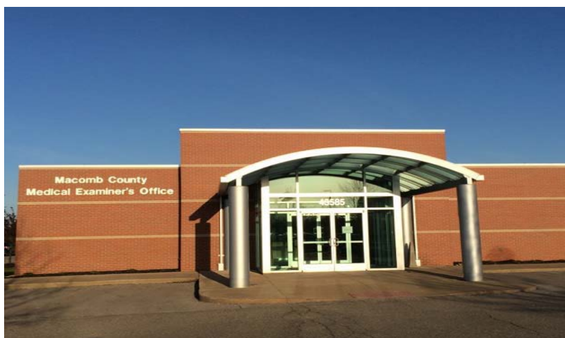
Medical Examiner's Office