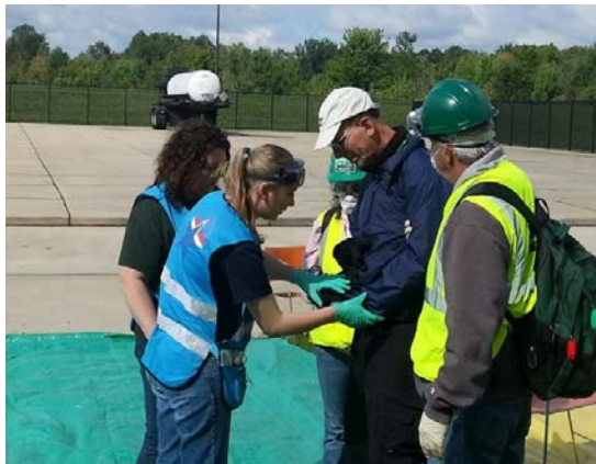
MRC volunteers in action