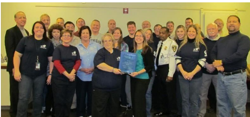
Macomb County Health Department Medical Reserve Corps 2013 Michigan Citizen Corps Team of the Year