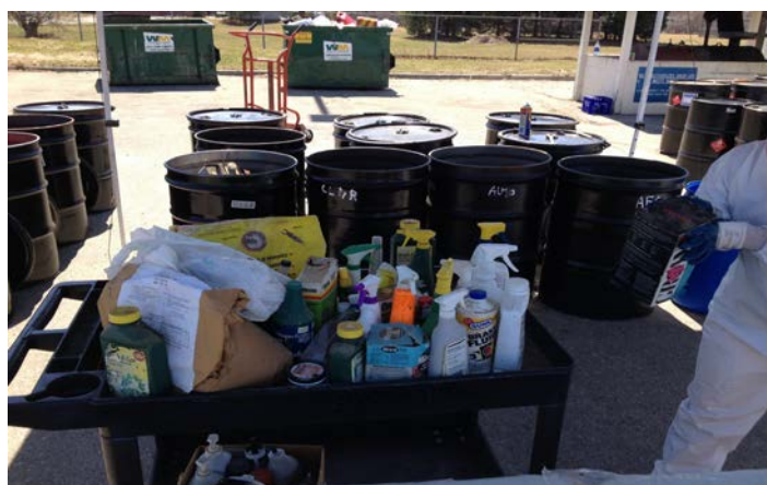
Household hazardous waste collection site