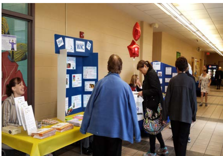
Community outreach activities