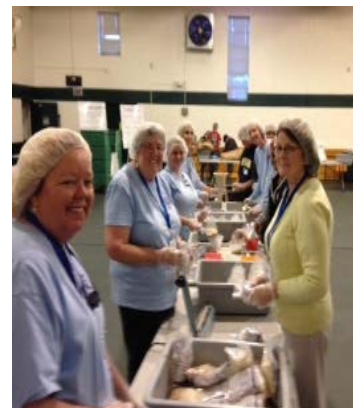
Assembling packages for Kids Against Hunger