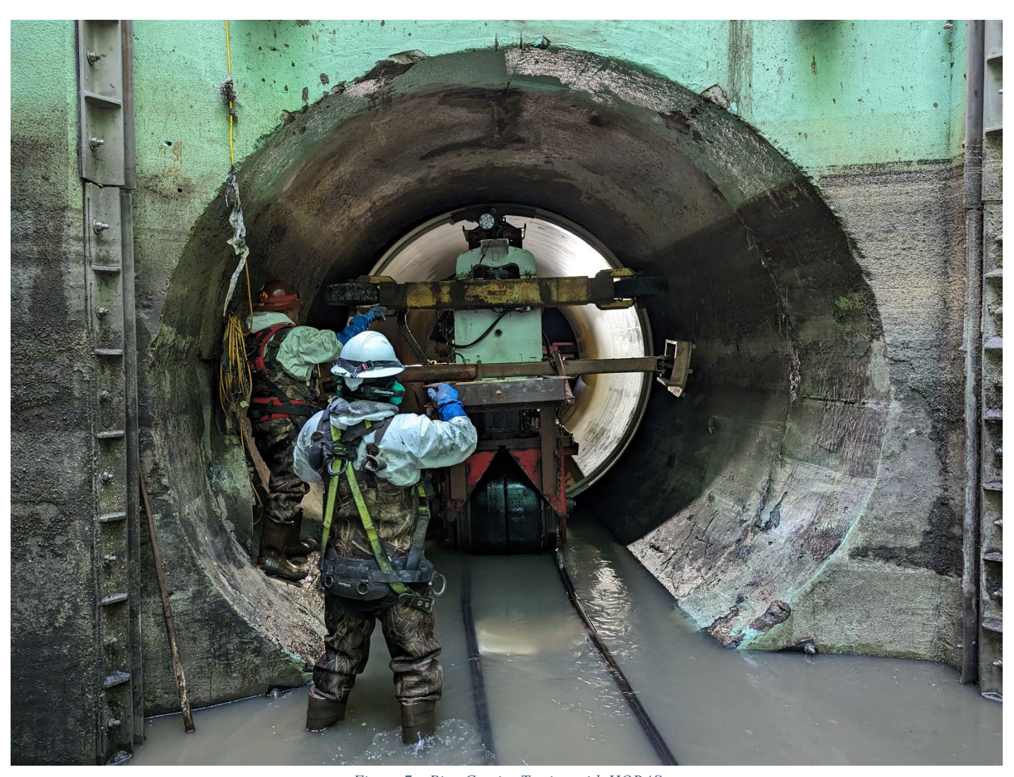
Figure 7 – Pipe Carrier Testing with HOBAS