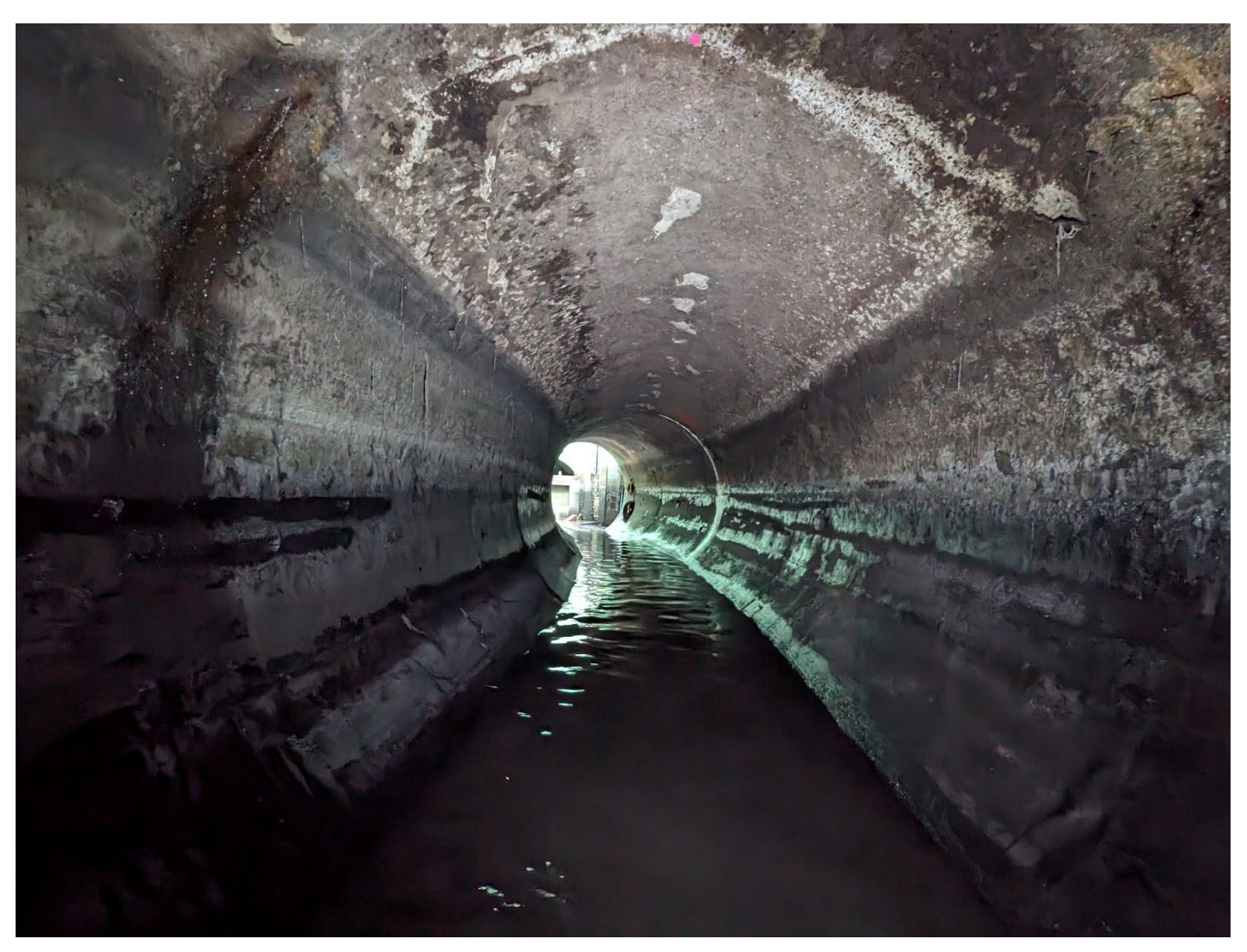
Figure 8 – RAI Curve Facing CS-12