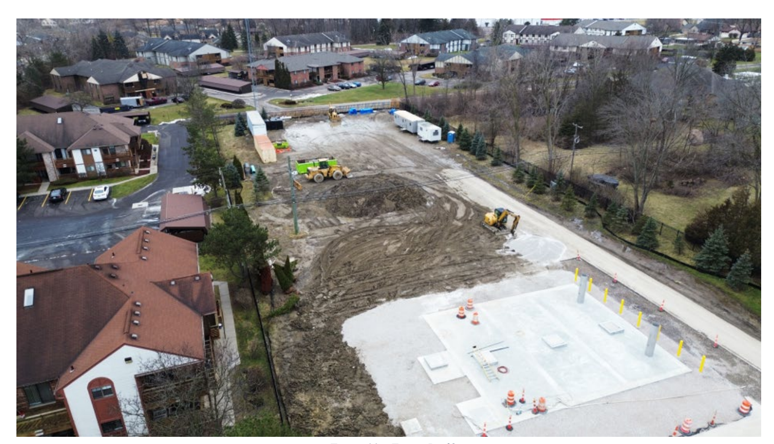
Figure 11 – Fraser Biofilter