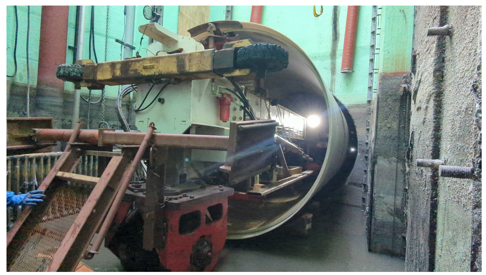
Figure 3 – Pipe Carrier Testing with HOBAS