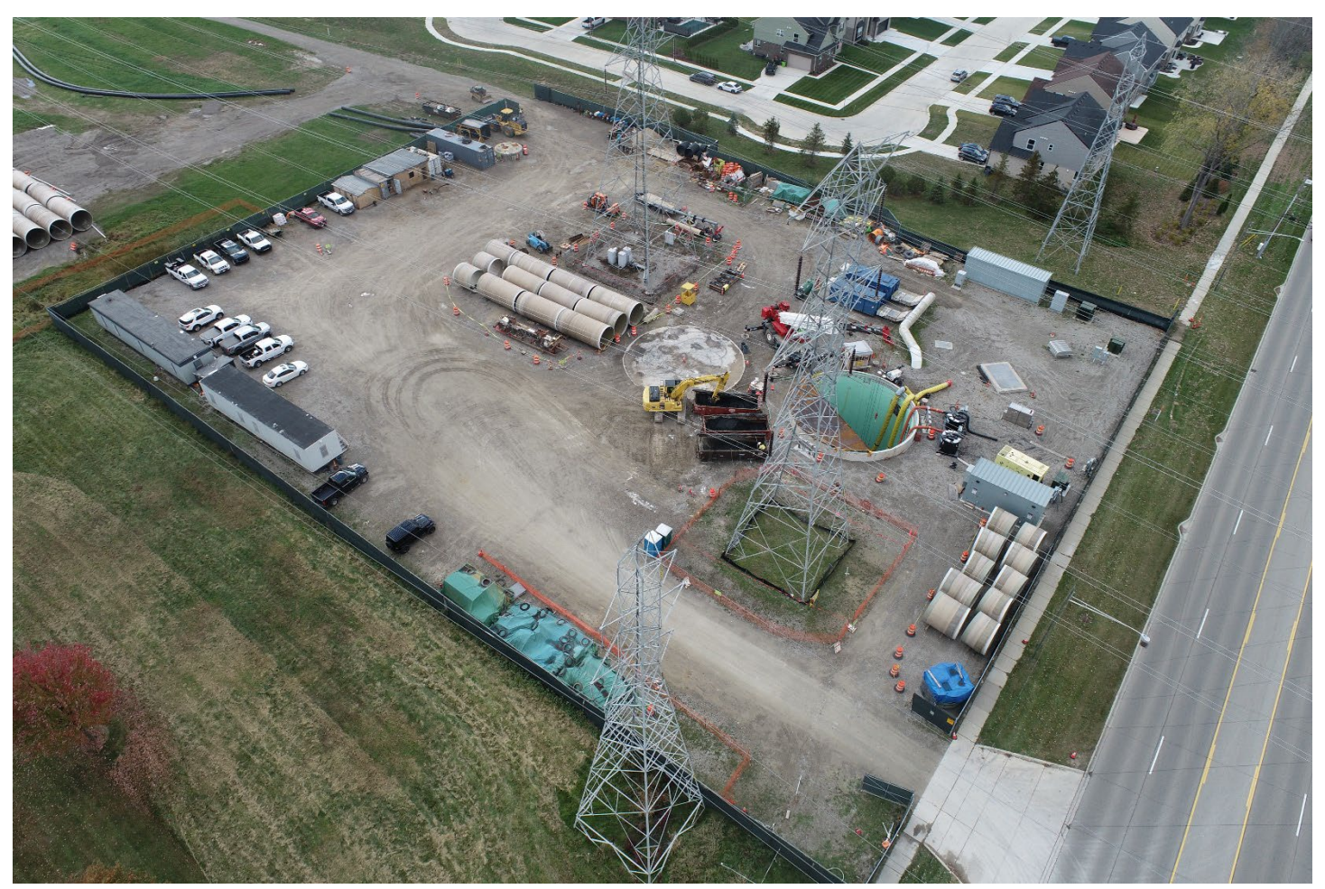
Figure 1 – CS-12 Pump Station, Construction Yard