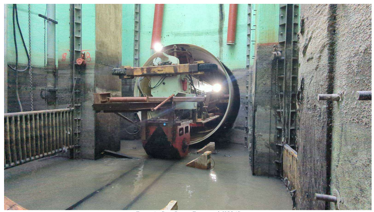
Figure 4 – Pipe Carrier Testing with HOBAS