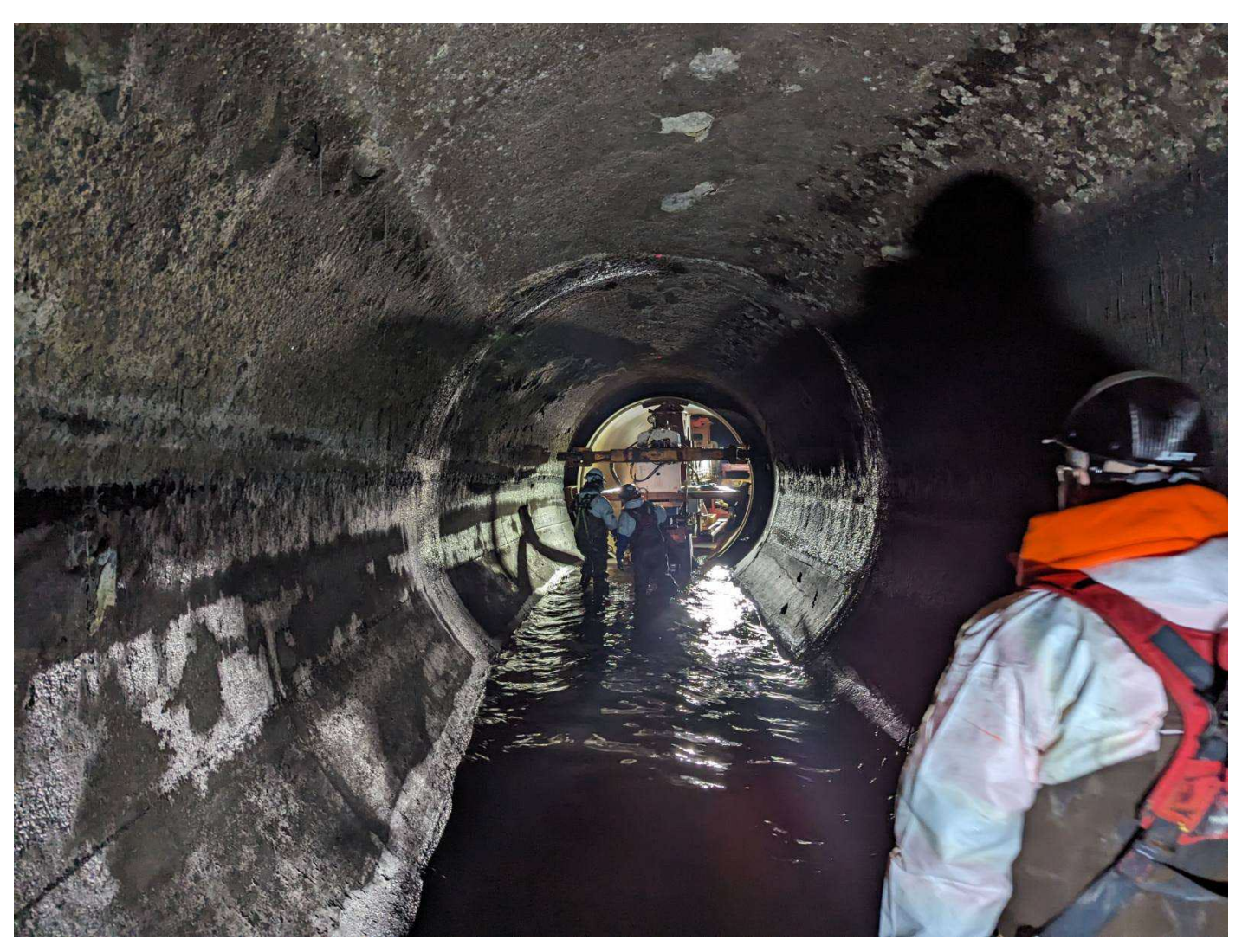
Figure 6 – Pipe Carrier Testing with HOBAS