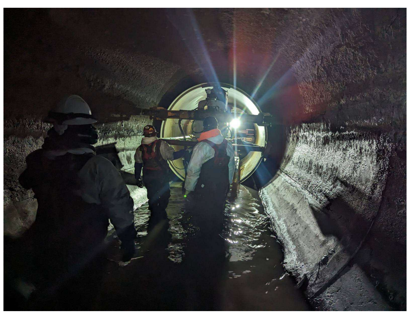
Figure 5 – Pipe Carrier Testing with HOBAS Pipe