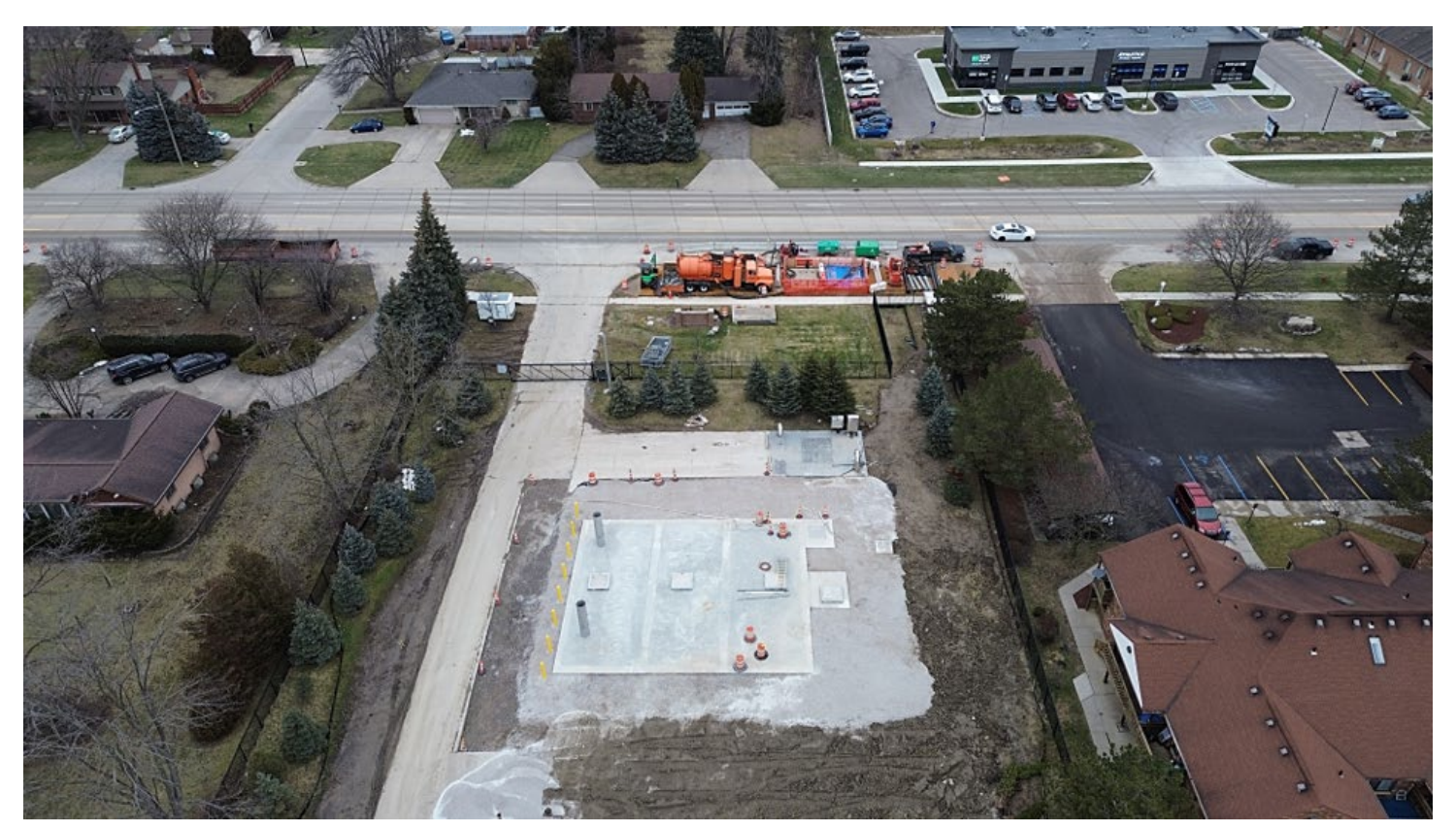
Figure 12 – Fraser Bio-Filter Access