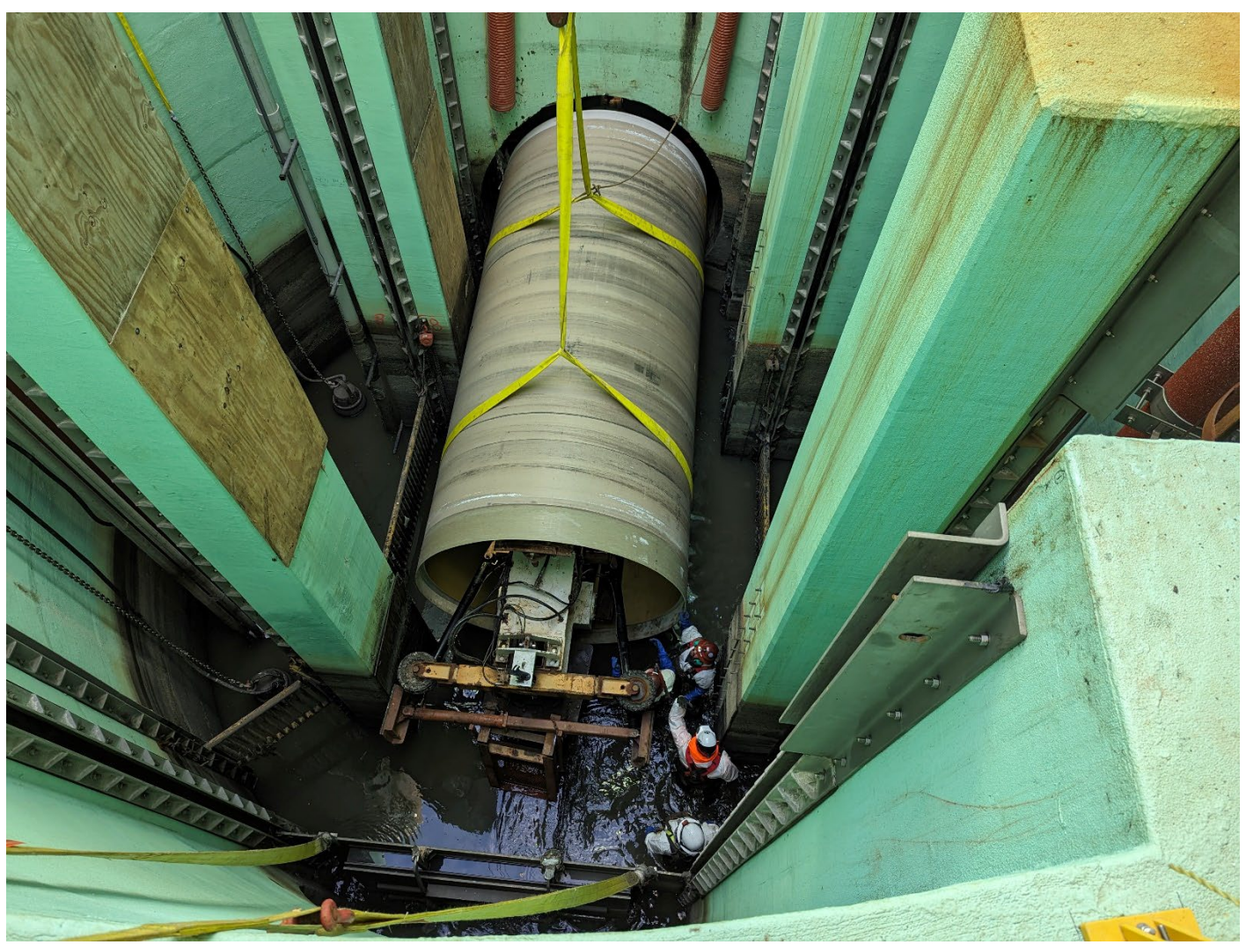
Figure 2 – Pipe Carrier Testing with HOBAS