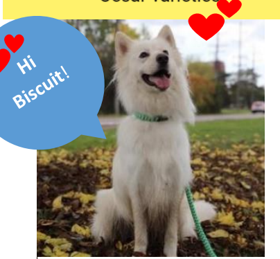
Dezi, an Australian Shepard mix