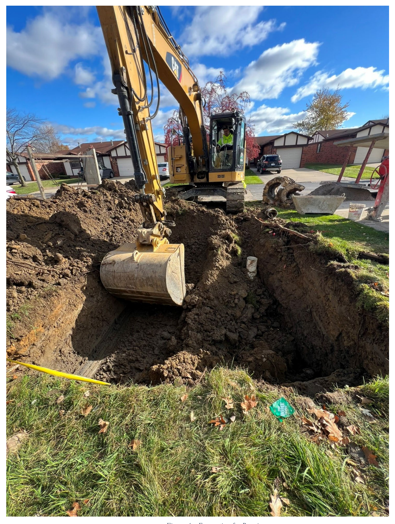
Figure \ 4-Excavation \ for \ Repair

OFFICE LOCATION : 21777 Dunham Road, Clinton Township, Michigan 48036 ◆ Phone: 586-469-5325 ◆ Fax: 586-469-5933 MAILING ADDRESS : P. O. Box 806, Mt. Clemens, Michigan 48046-0806