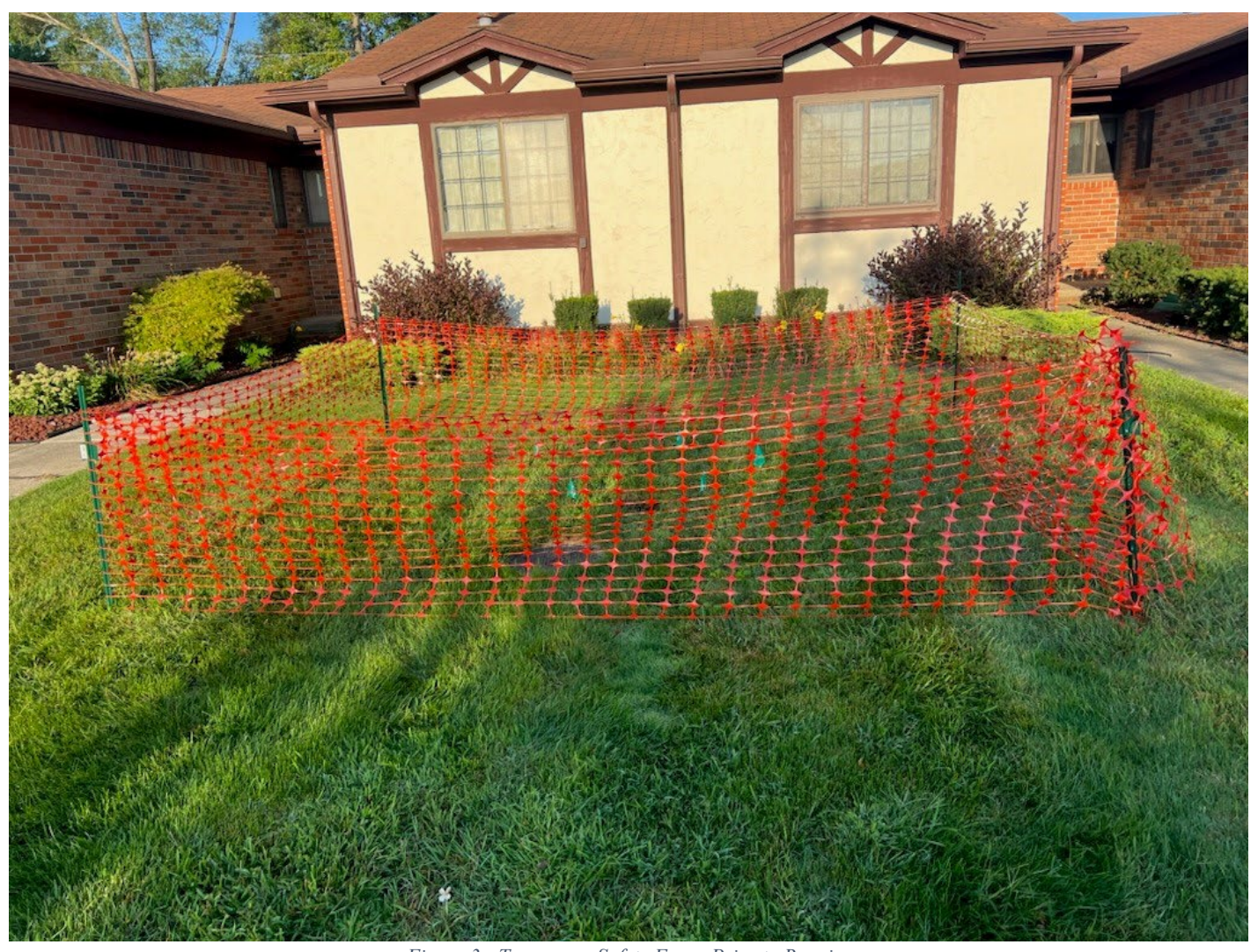
Figure 3 - Temporary Safety Fence Prior to Repairs