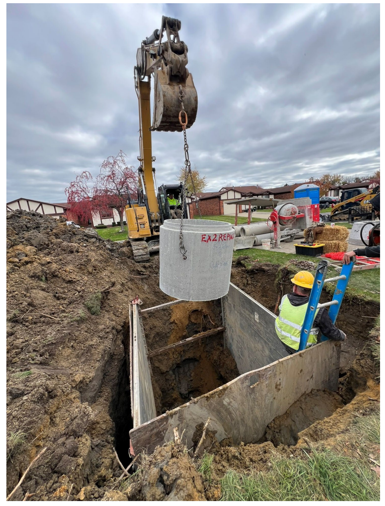
Figure 6 – Installation of New Manhole Structure

OFFICE LOCATION : 21777 Dunham Road, Clinton Township, Michigan 48036 ◆ Phone: 586-469-5325 ◆ Fax: 586-469-5933 MAILING ADDRESS : P. O. Box 806, Mt. Clemens, Michigan 48046-0806