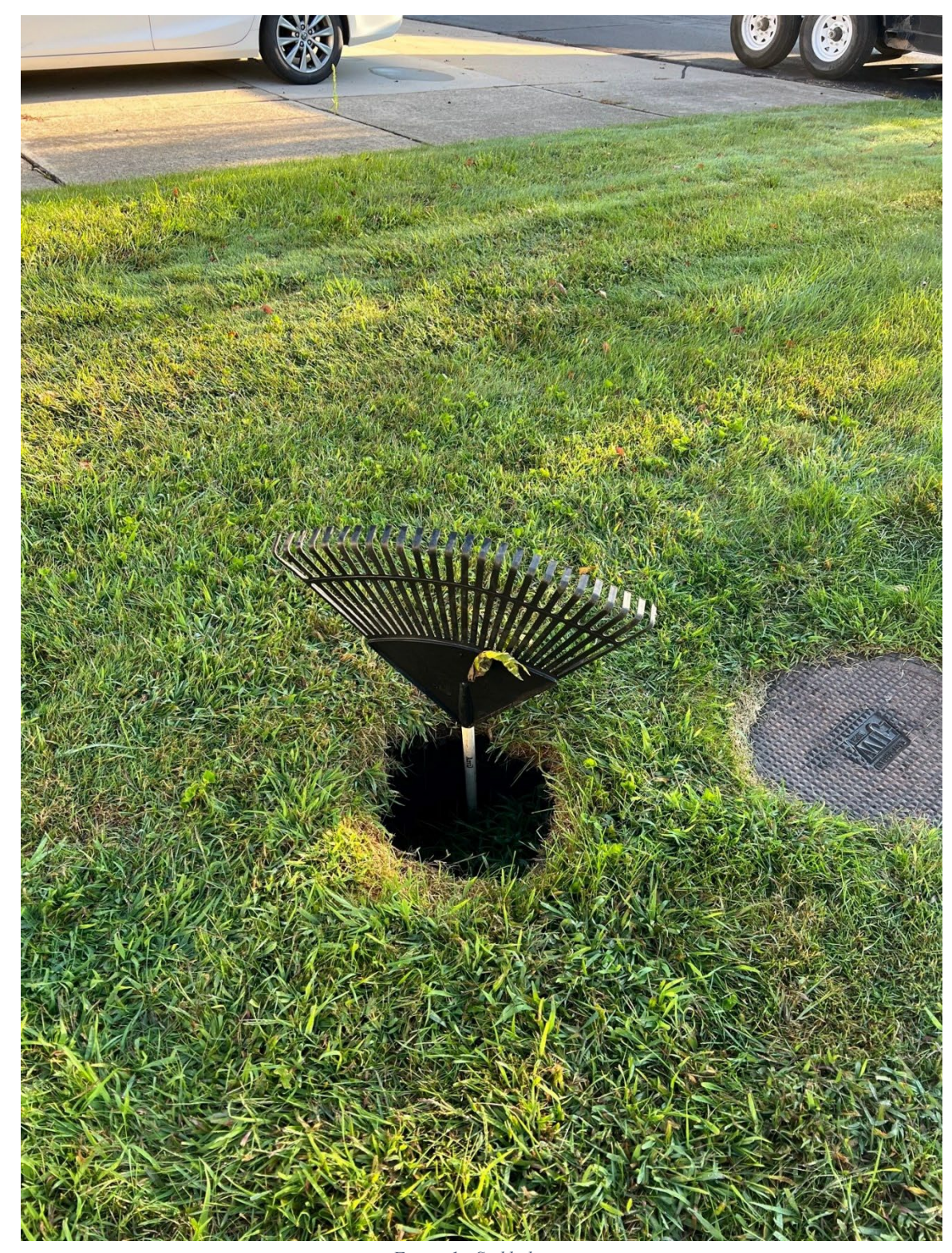
Figure 1 - Sinkhole