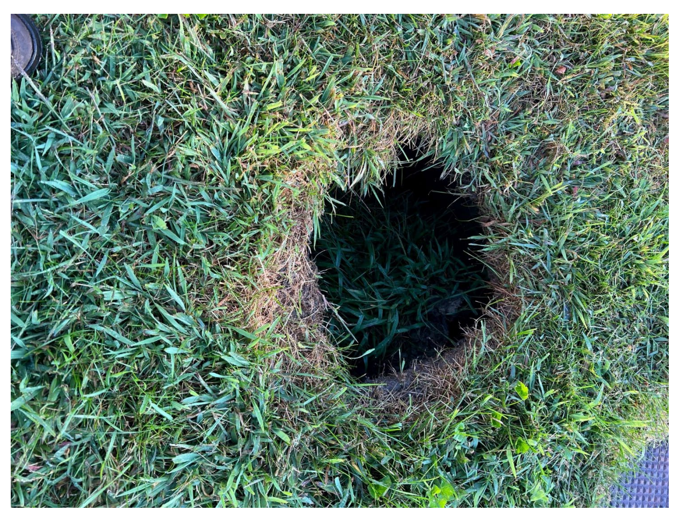
Figure 2 - Sinkhole