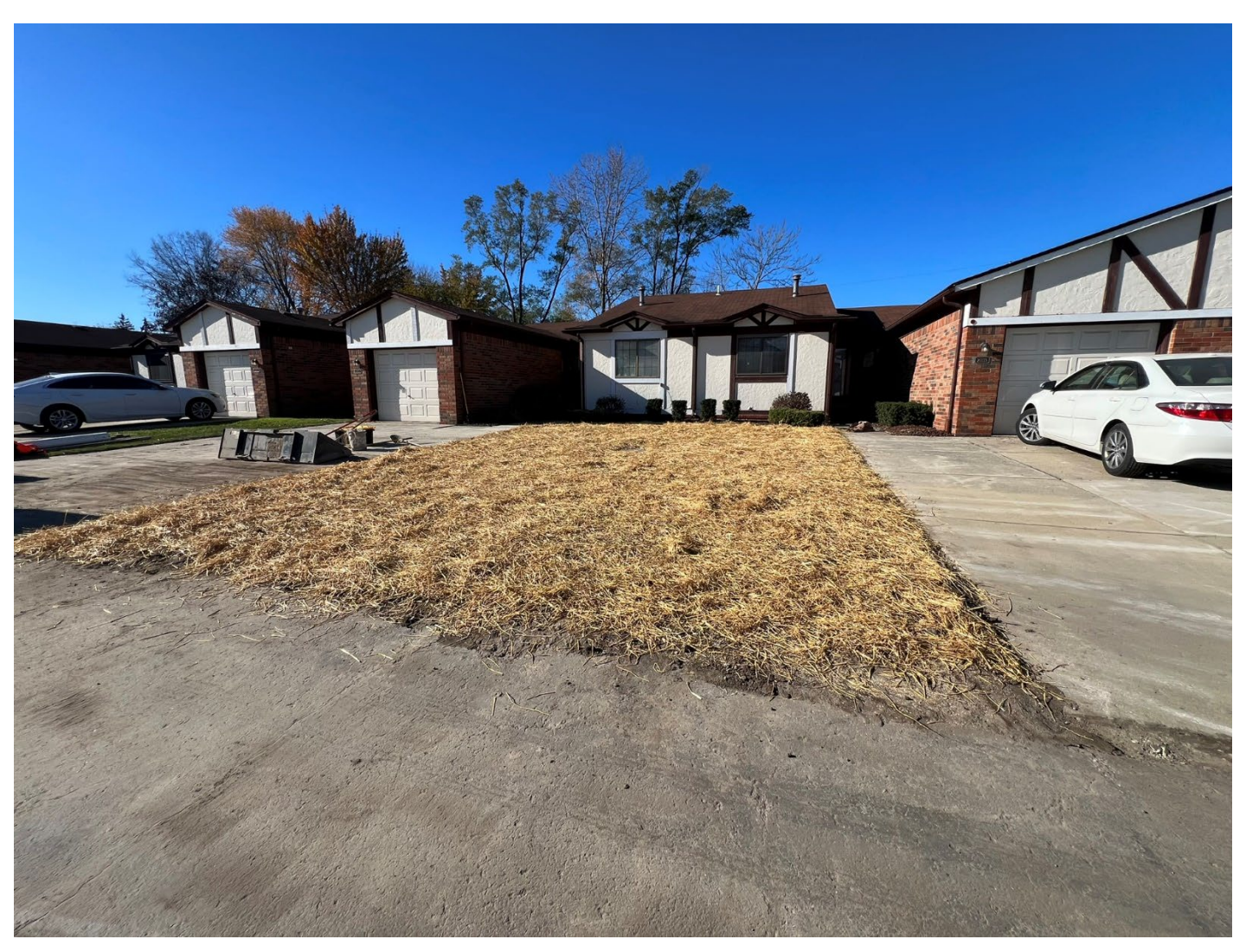
Figure 7 – Site Restoration