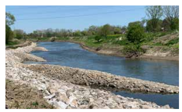
During strong or higher flow, especially after heavy rain, the three completed "J-hooks" at the Red Run Drain work in unison to prevent erosion of the drain bank by directing the flow toward the center of the channel.

The 1.35-mile path along the north bank was carved, and top soil was used to make the trail. The planting of 475 trees, 2,500 shrubs and 4,000 native pollinator plants along the north side of the Red Run Drain and within the Sterling Relief Drain began this year and will be completed in spring 2023. Once fully established, the plantings help prevent erosion and act as green infrastructure to capture and filter an estimated 200,000 gallons of storm water runoff per year to remove phosphorus and nitrogen. It's also part of the Green Macomb Urban Forest Partnership and will increase habitat biodiversity.