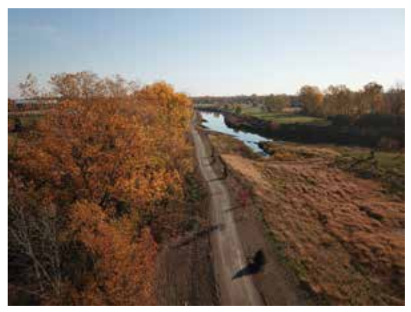
The completed hike/bike trail along the Sterling Relief Drain portion of the 1.35-mile path