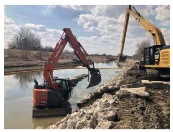
Construction of "j-hooks" in the red run drain

Schoenherr Road. The Red Run Intercounty Drain Board and the Sterling Relief Drain Board approved the plan, and Sterling Heights officials endorsed it.