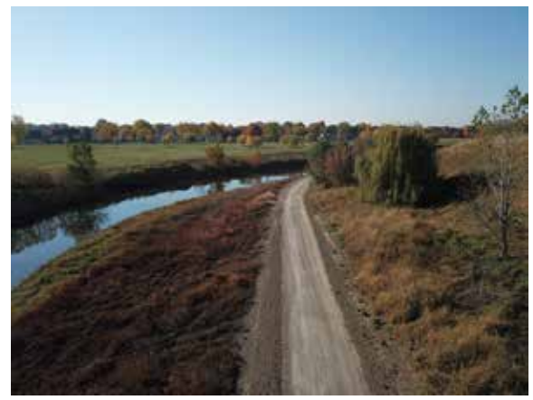
The completed hike/bike trail along the Red Run Drain portion of the 1.35-mile path

A video of the partnership/project can be seen on the Macomb County Public Works Office YouTube channel at <a href="https://youtu.be/DWH_">https://youtu.be/DWH_</a> OPQzo-Q