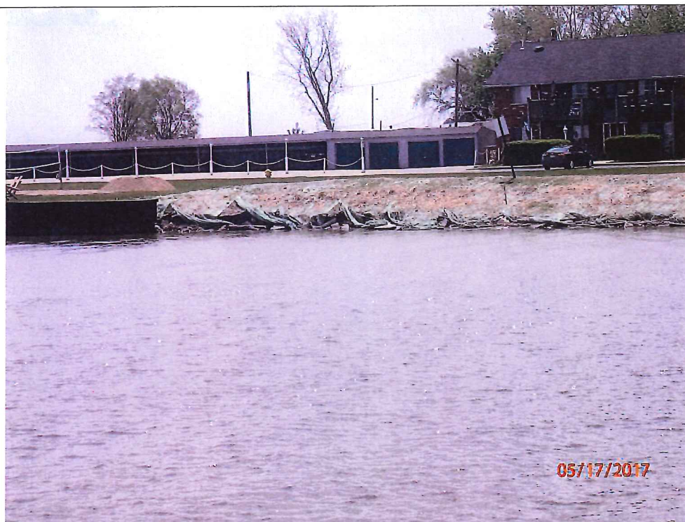
Photo 71: Bank restoration near Lake St. Clair (south side). Erosion fabric appears poorly anchored.