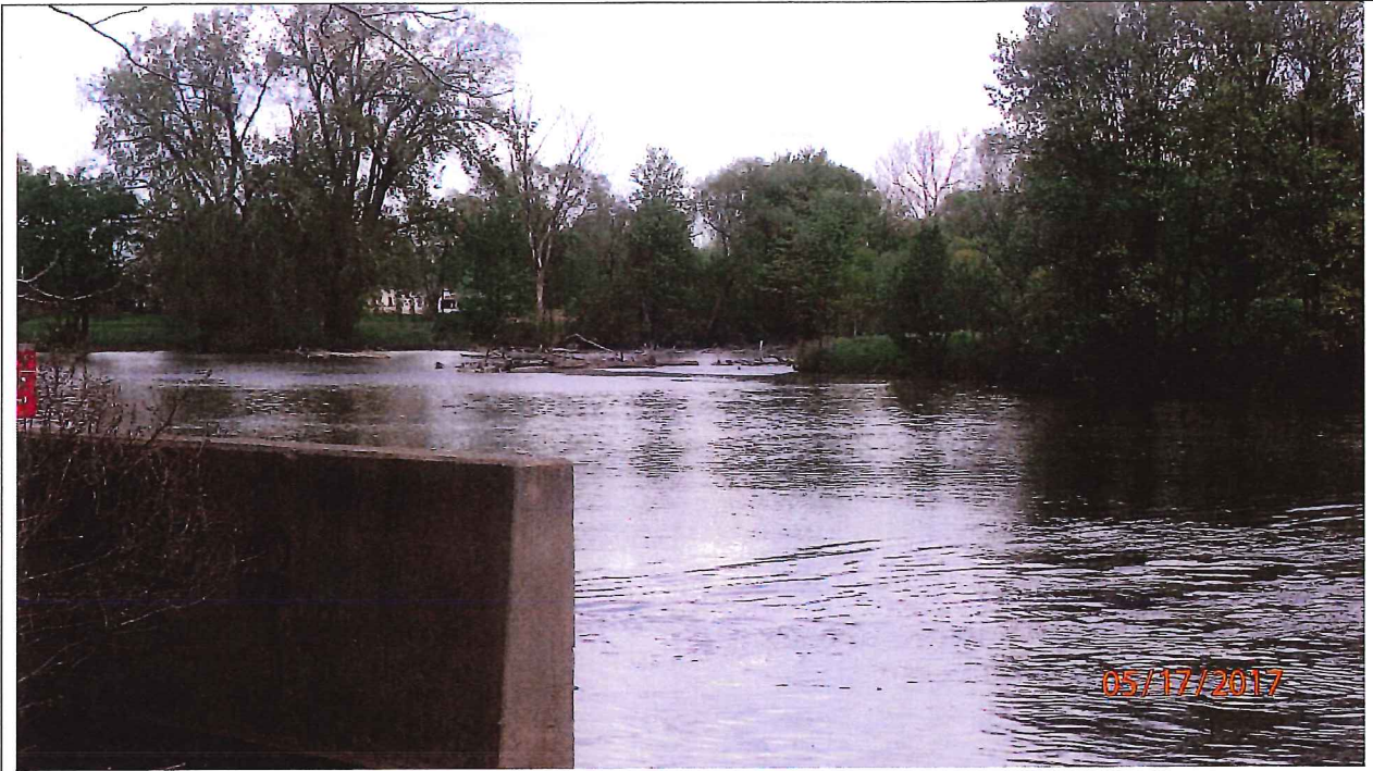
Photo 62: Clinton River Spillway Weir, with Clinton River in the background. Note woody debris.