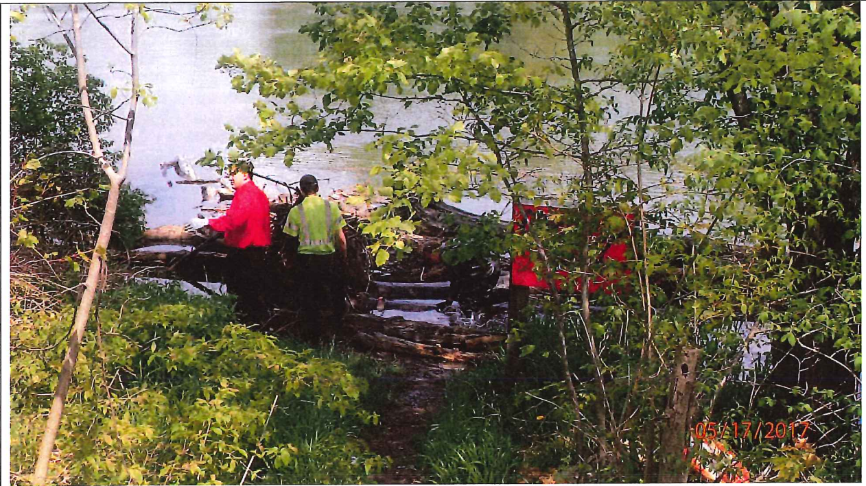
Photo 60: Large trees in channel near the Clinton River Spillway Weir. The trees were being removed via a winch during the inspection.