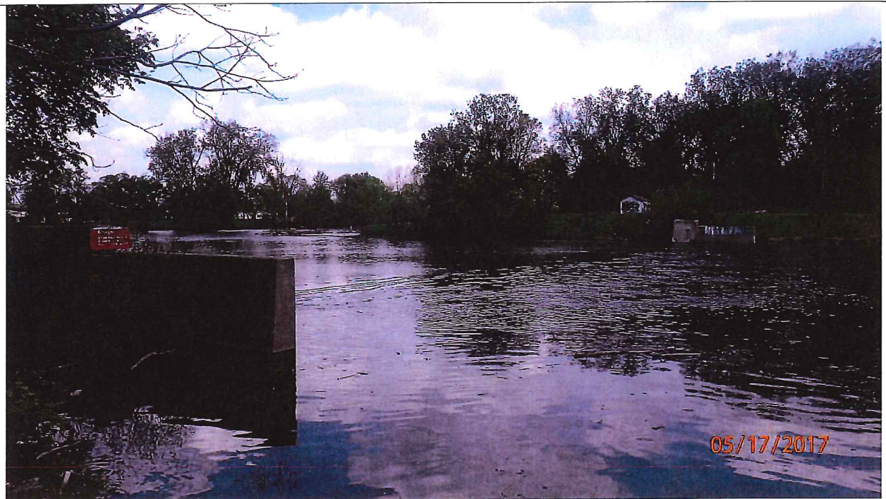
Photo 61: Clinton River Spillway Weir. No major structural defects noted.