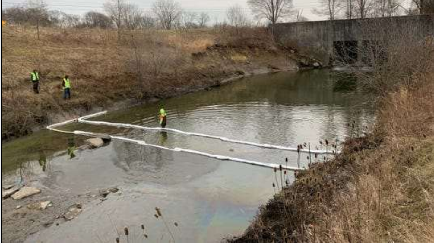
Along the Schoenherr Relief Drain in Warren, near the source of a petroleum spill in early January 2020.