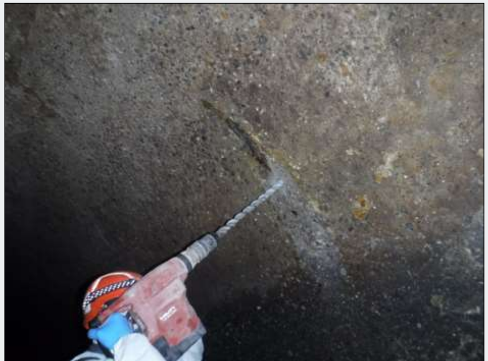
Drilling a hole to insert grout into the Romeo Arm pipe under 15 Mile Road.

The work involves drilling fill-ports into the side of the concrete interceptor and injecting an acrylamide chemical grout. The purpose is to fill cracks in the pipe to prevent the infiltration of groundwater and the migration of surrounding soils into the pipe. The program has been effective and the areas of previously observed infiltration have been successfully sealed. Future