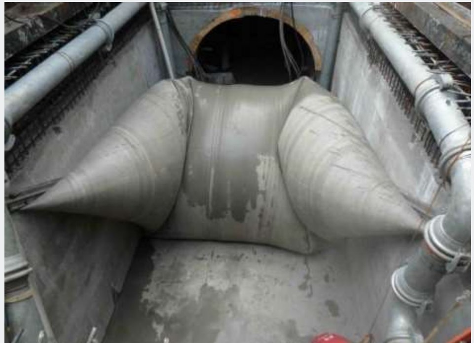
An example of an inflatable bladder that may be used to support an In-System Storage Project.

Together, these two projects will allow MCPWO to store about 10 mil-