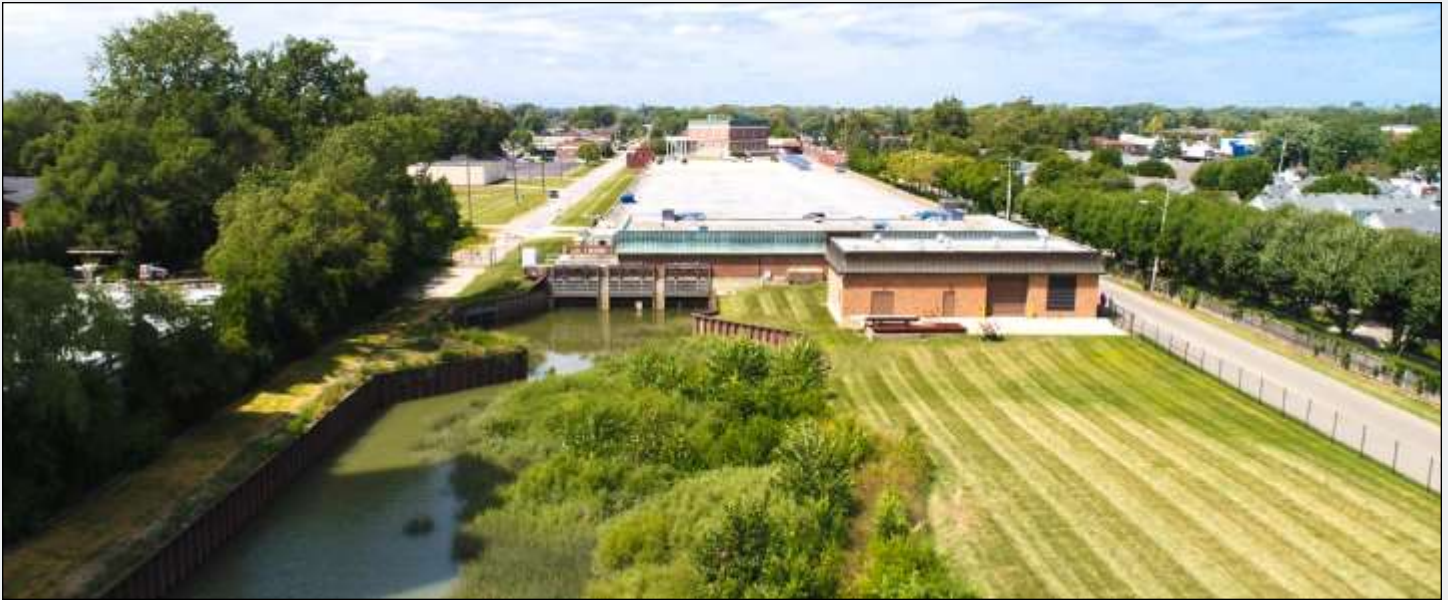
The Chapaton Retention Basin in St. Clair Shores, is seen from the east. To the left of the photo is a canal that connects the basin to Lake St. Clair. The building in the foreground is where combined sewer overflow is treated with a heavy commercial bleach solution to kill contaminants. Behind that building is what appears to be a parking deck. The 28-million-gallon basin is under the deck. The pump station building is in the far background of the photo.