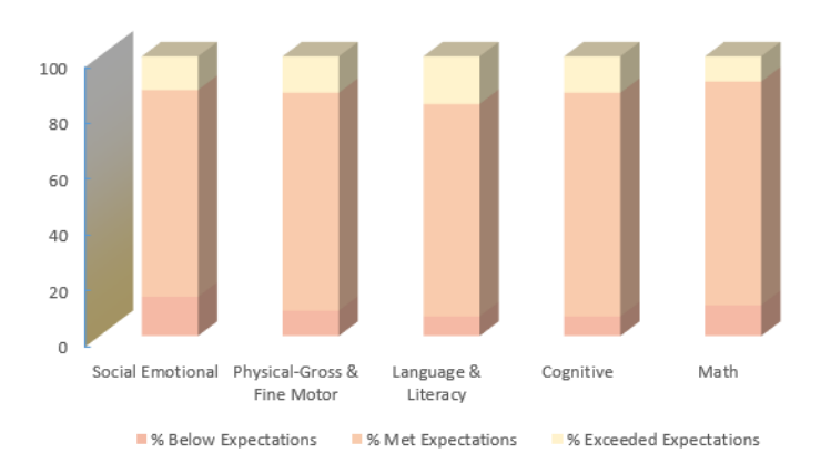
Head Start 3 - 5 ♦ School Readiness Goals 2019-20