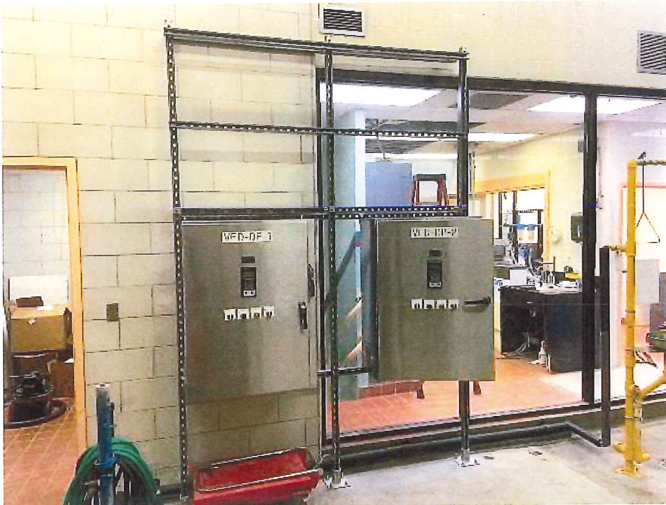
Figure 1 – Two new VFD cabinets to power Hose Pumps