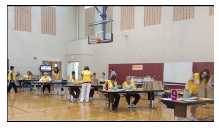
Warren Mott High School Dispensing Site

Macomb County Health Department Public Health Emergency Preparedness program focuses on preparing for and responding to events that pose a substantial risk to the health of Macomb County residents. The program supports and enhances the capacity of the county to prepare for public health threats and emergencies through planning, exercising, responding and training.