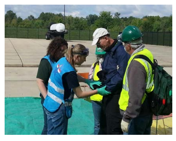
MRC volunteers in action