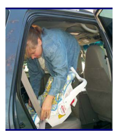
Car seat check event