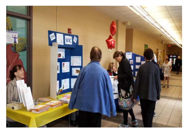
Community outreach activities