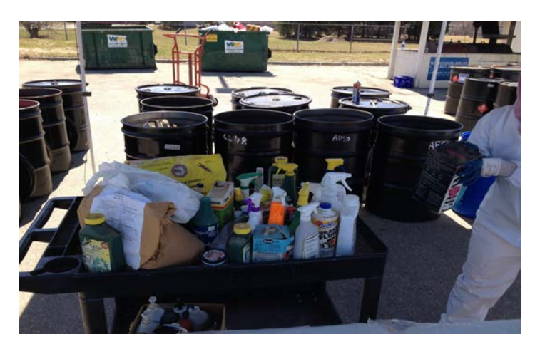
Household hazardous waste collection site