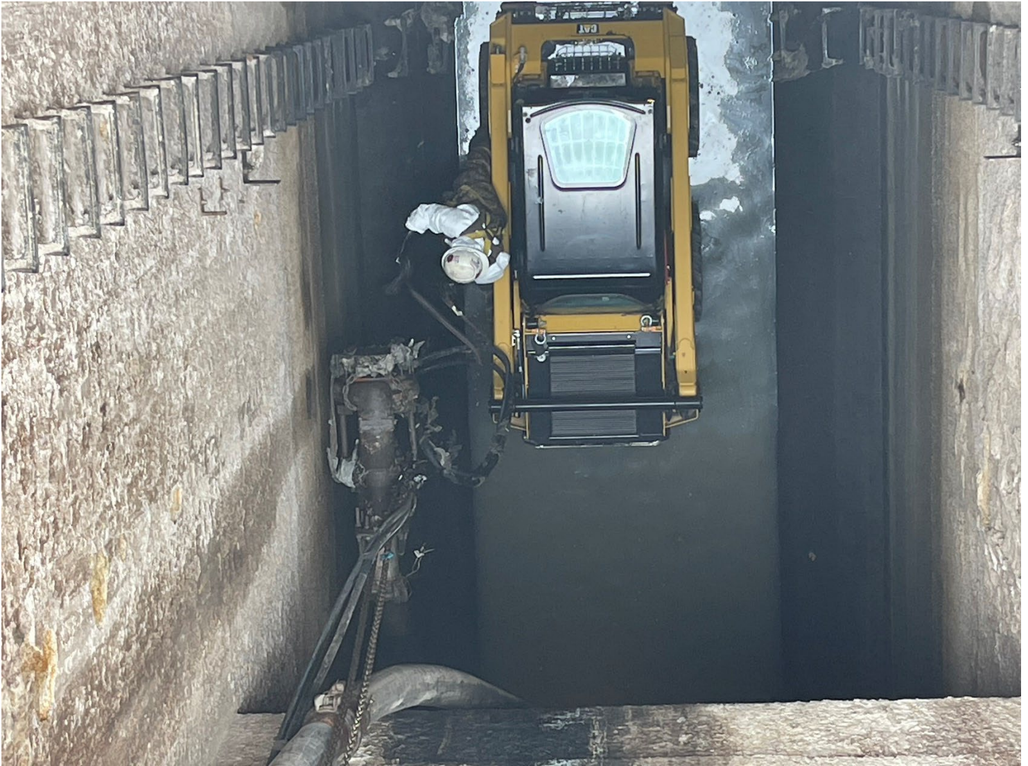
Figure 8 – Skid-Steer in the Interceptor