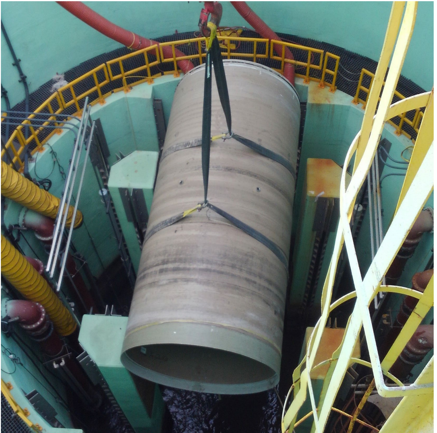
Figure 2 – Hoisting HOBAS Pipe into CS-12 (daily operation for while slip-lining)