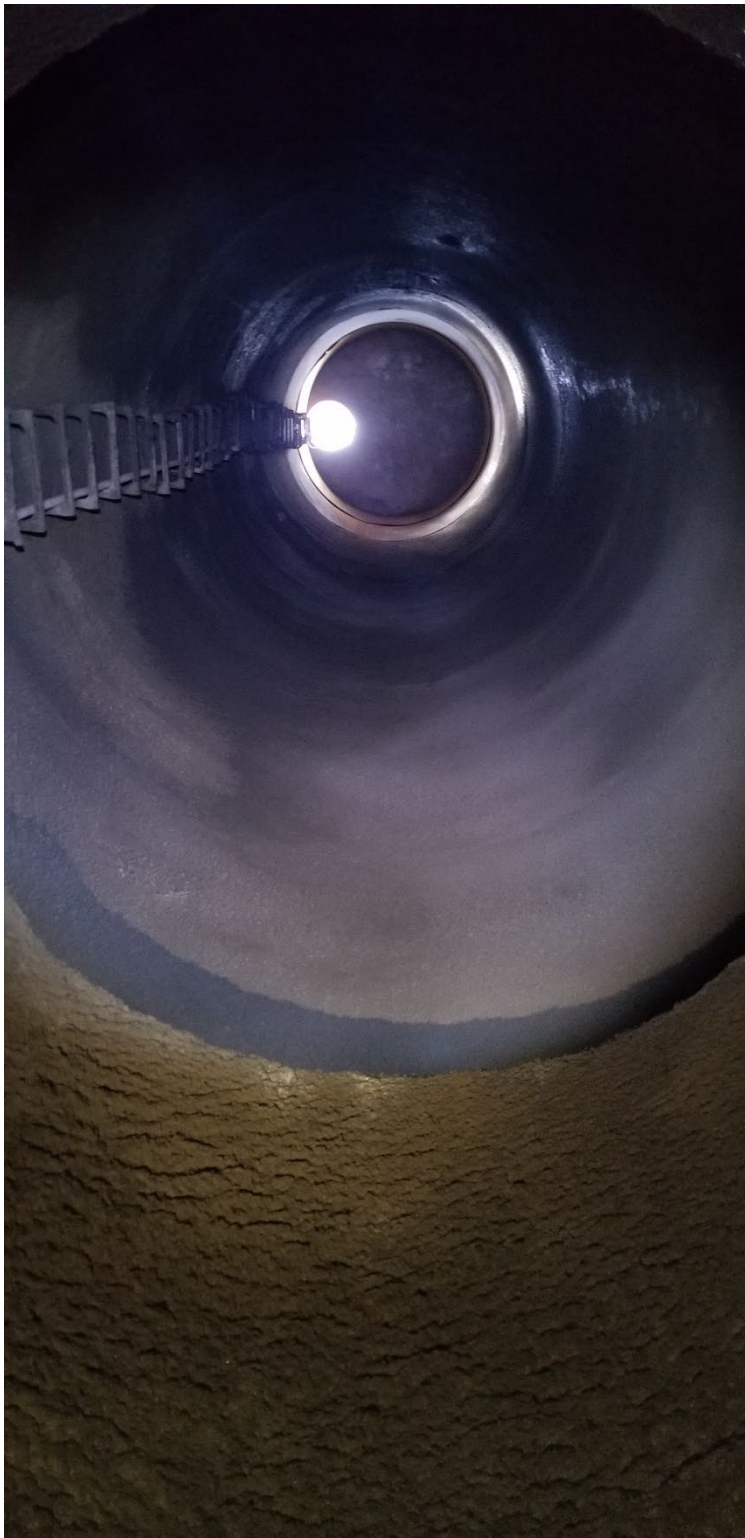
Figure 5 – Spray-Lining at MH-06