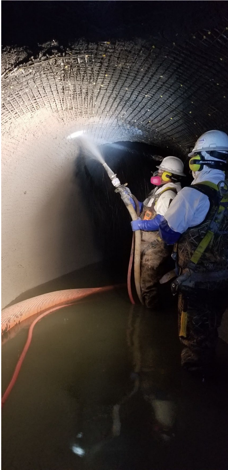
Figure 4 – Spray-Lining at Transition to HOBAS