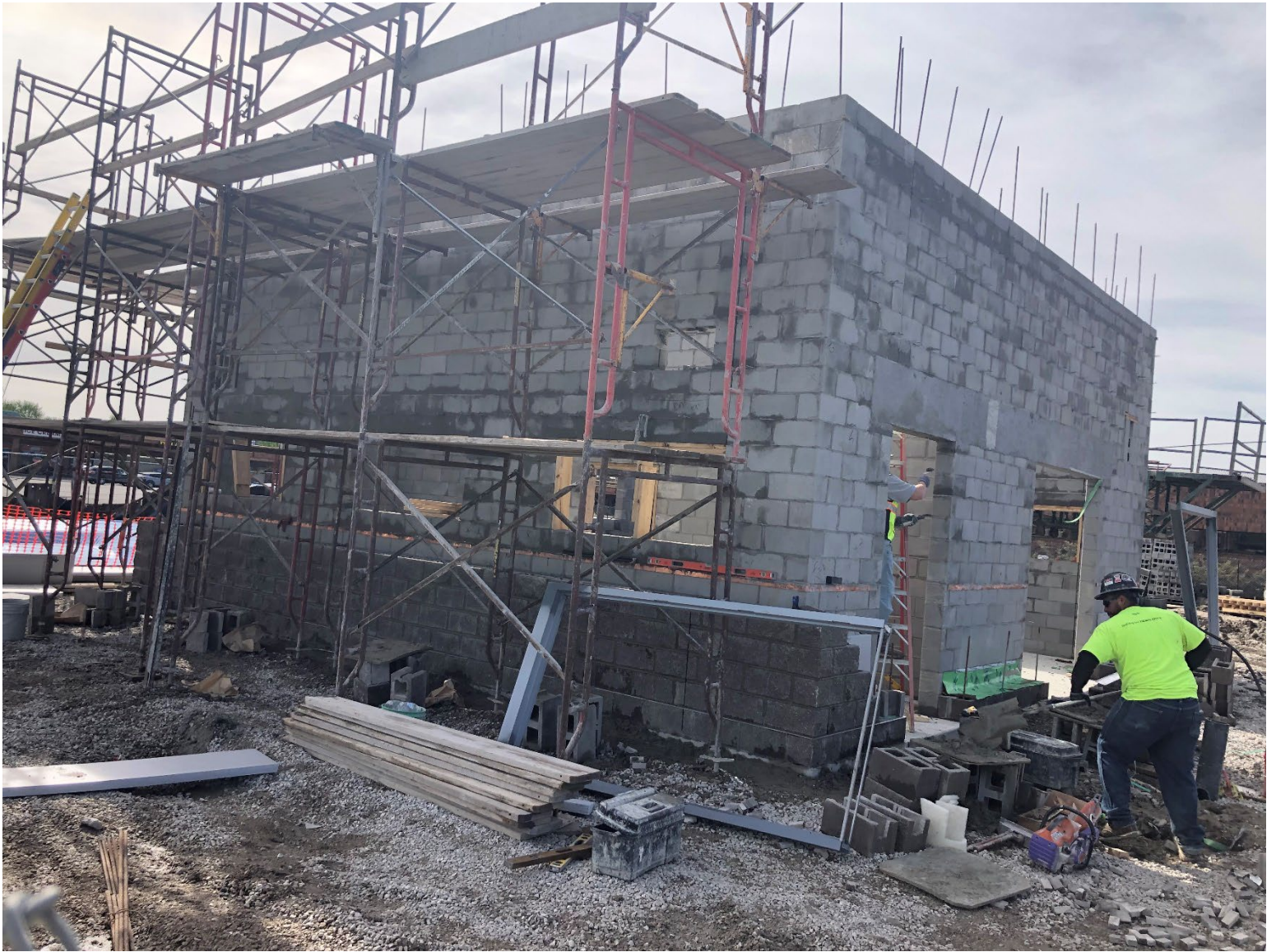
Figure 13 – Macomb Township Masonry Work for Utility Building