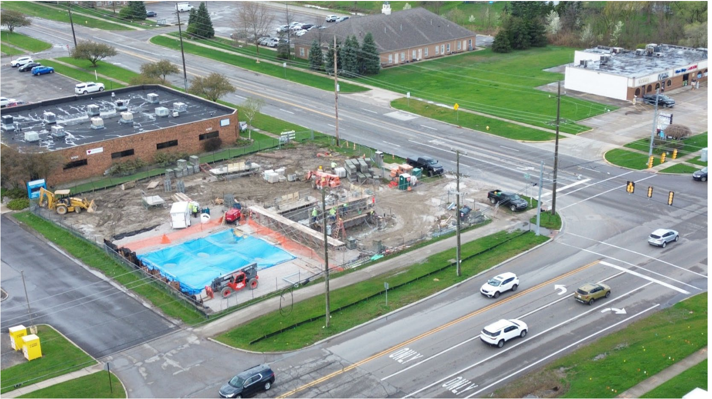
Figure 11 – Aerial View of the Maccomb Twp. Bio-Filter