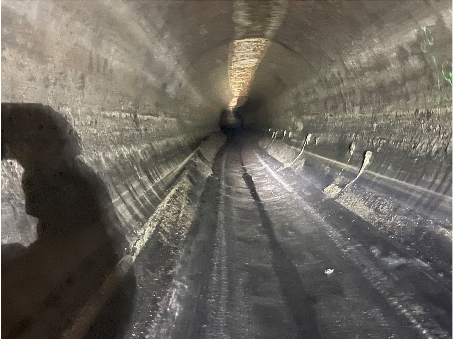
Figure 9 – RAI Post-Cleaning