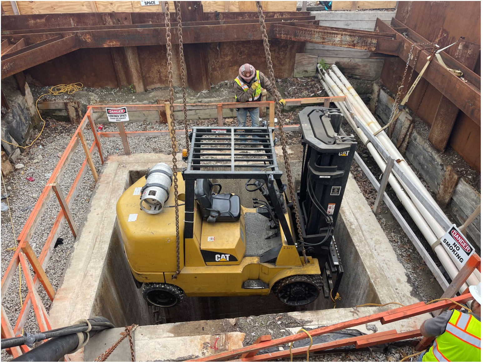
Figure 7 – Lowering Skid-Steer into Interceptor at CS-2