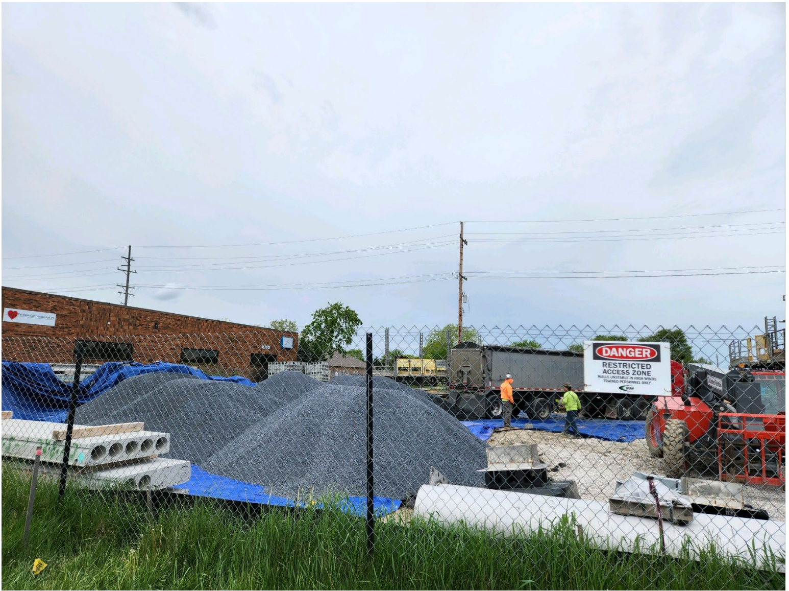
Figure 12 – Carbon Media Delivery at Macomb Twp. Site