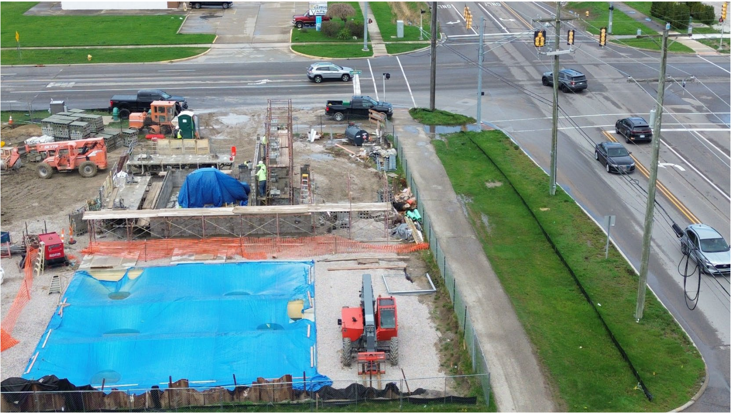
Figure 10 – Aerial View of the Macomb Bio-Filter – Masonry Work Underway