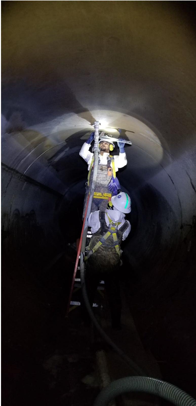
Figure 3 – Grout Injection into Annular Space