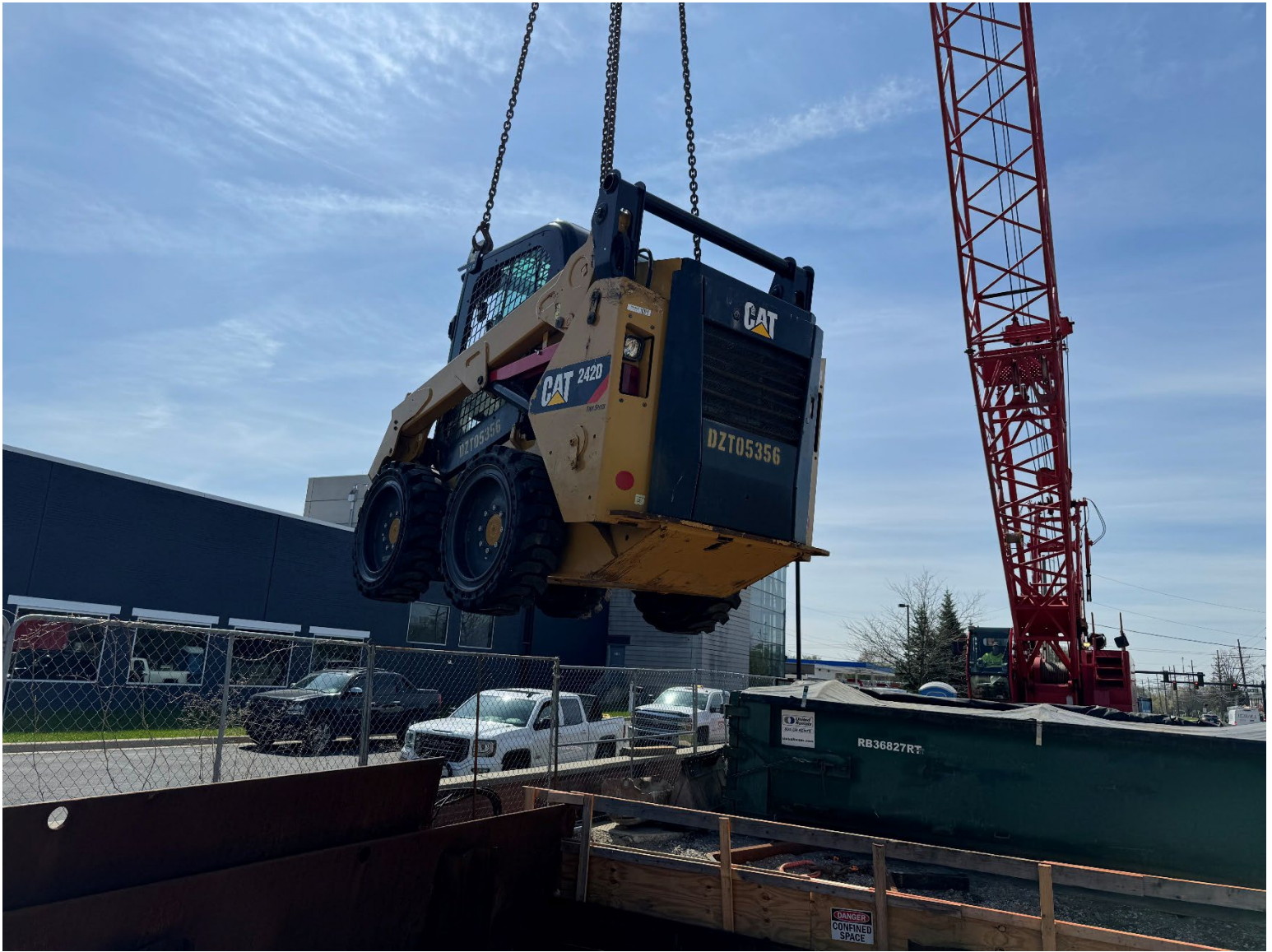
Figure 6 – Lowering Skid-Steer into Interceptor at CS-2