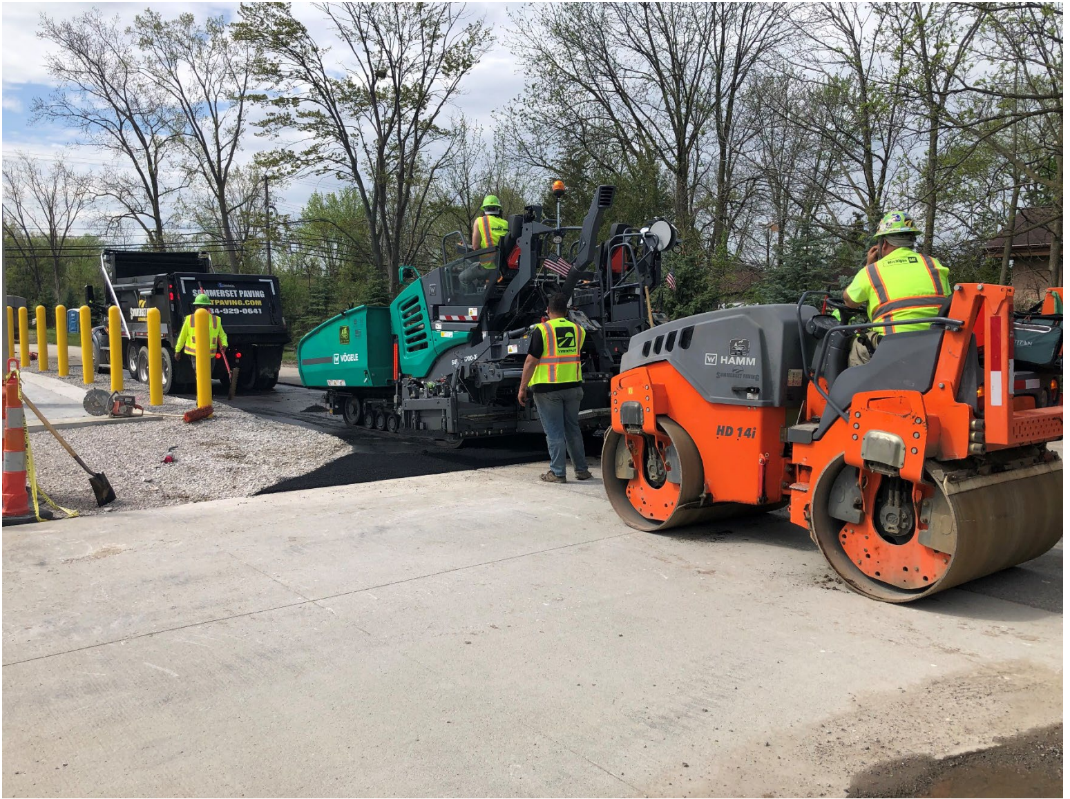
Figure 14 – Asphalt Replacement at Fraser Bio-Filter