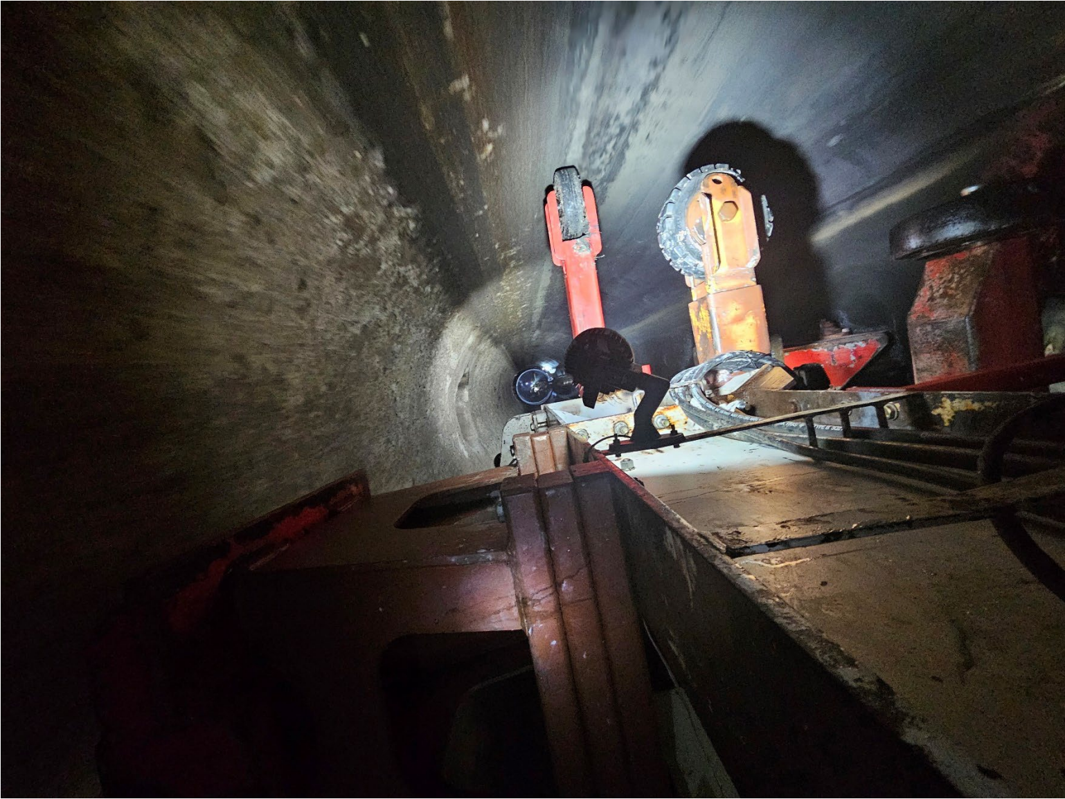
Figure 6 – Pipe Carrier Returning to CS-12 after Setting Pipe (view looking upstream)