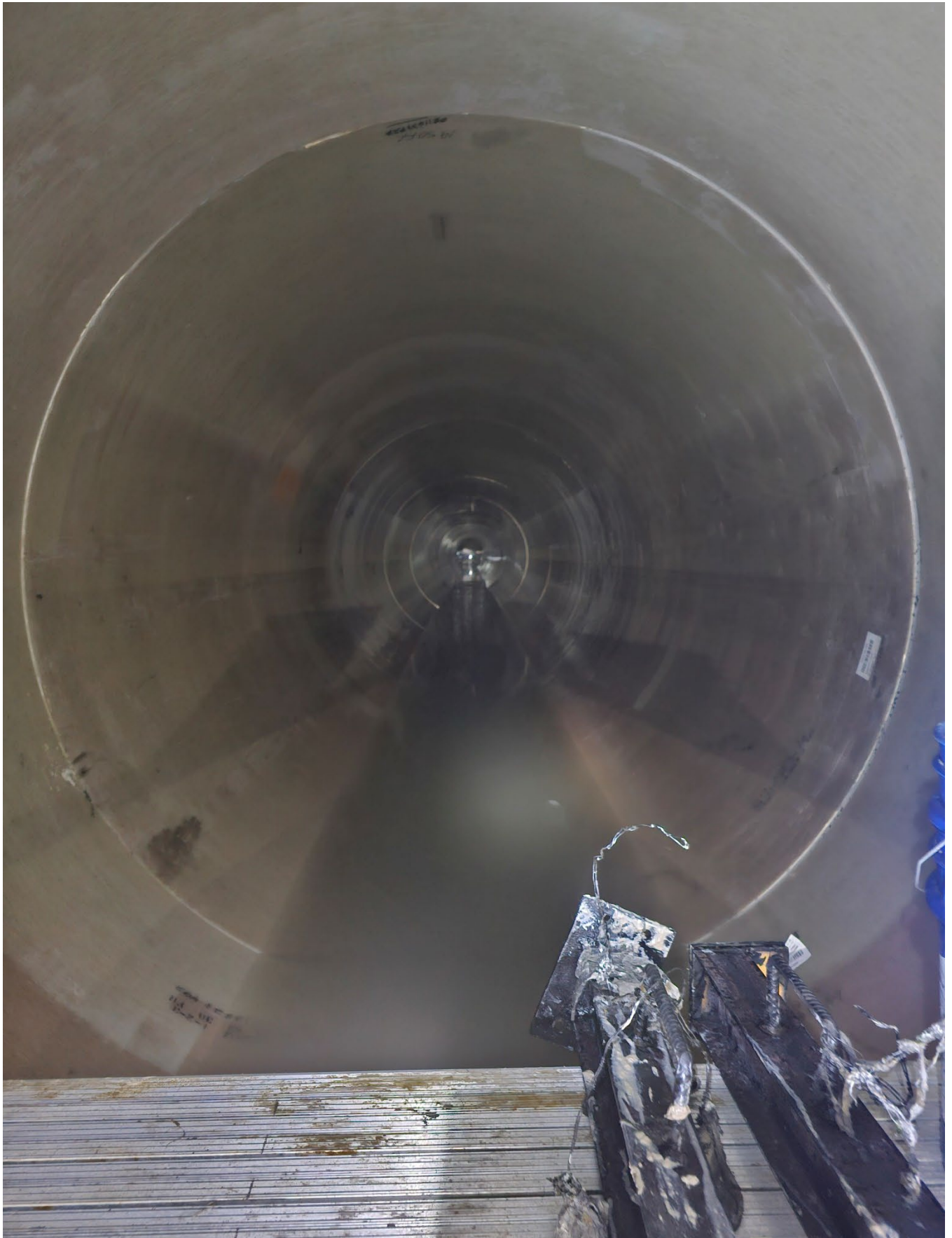
Figure 7 – View Upstream of Installed HOBAS Pipe

OFFICE LOCATION: 21777 Dunham Road, Clinton Township, Michigan 48036 • Phone: 586-469-5325 • Fax: 586-469-5933 ENGINEERING • Phone: 586-469-5910 • Fax: 586-469-7693 ♦ SOIL EROSION • Phone: 586-469-5327 • Fax 586-307-8264