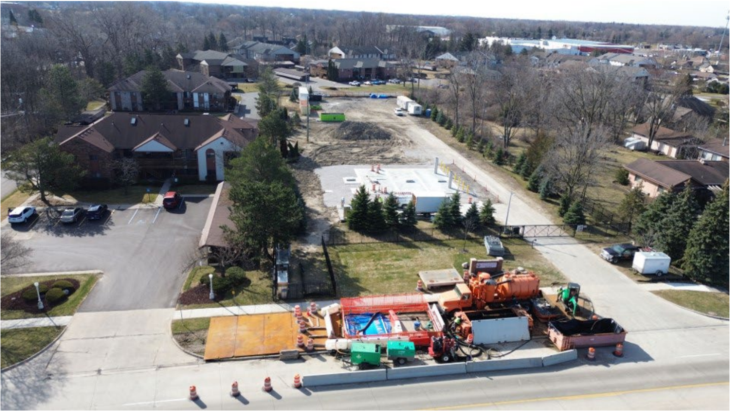
Figure 8 – Aerial View at CS-3 of Debris Removal Equipment