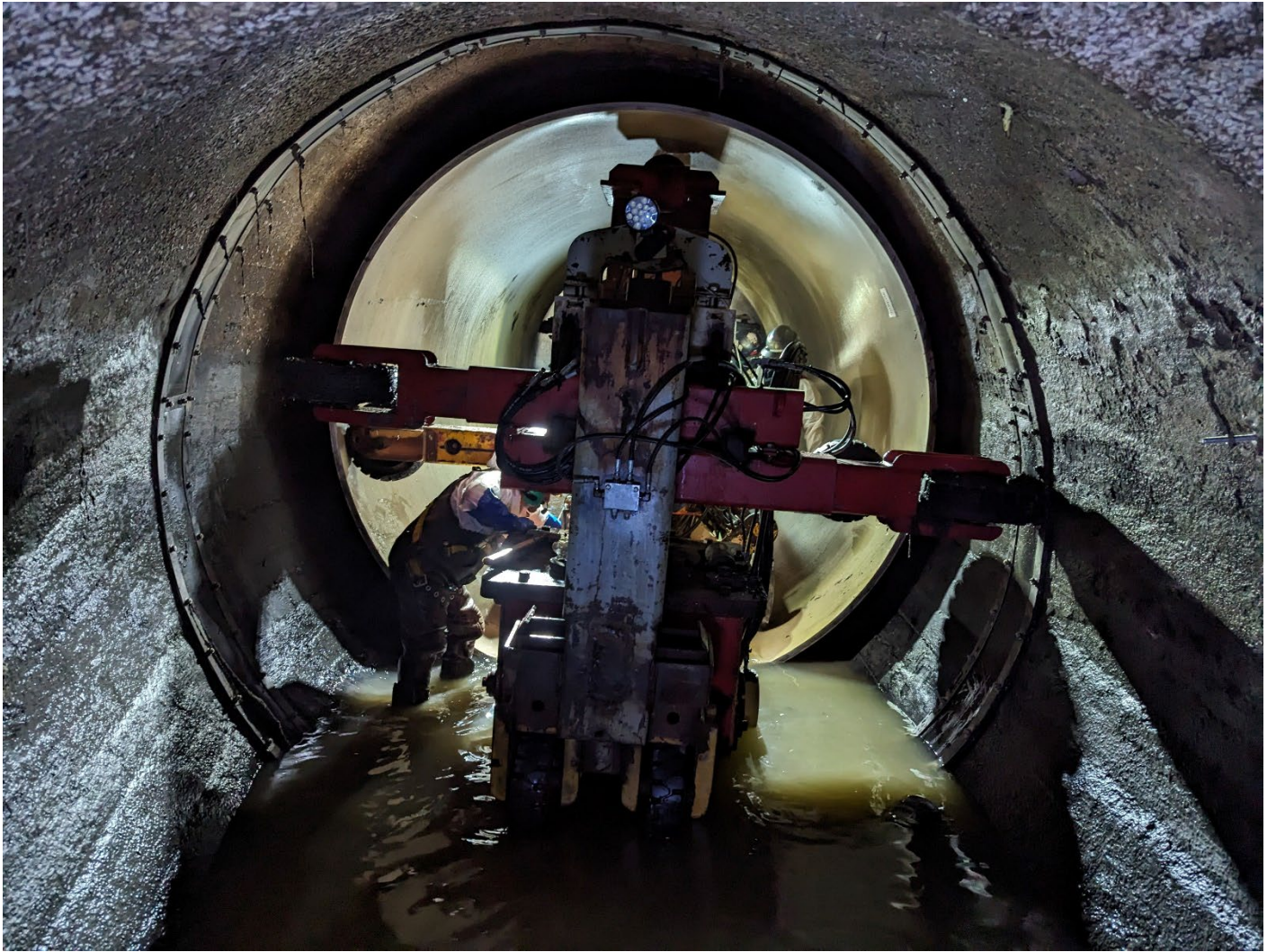
Figure 5 – Setting the First Section of HOBAS Pipe