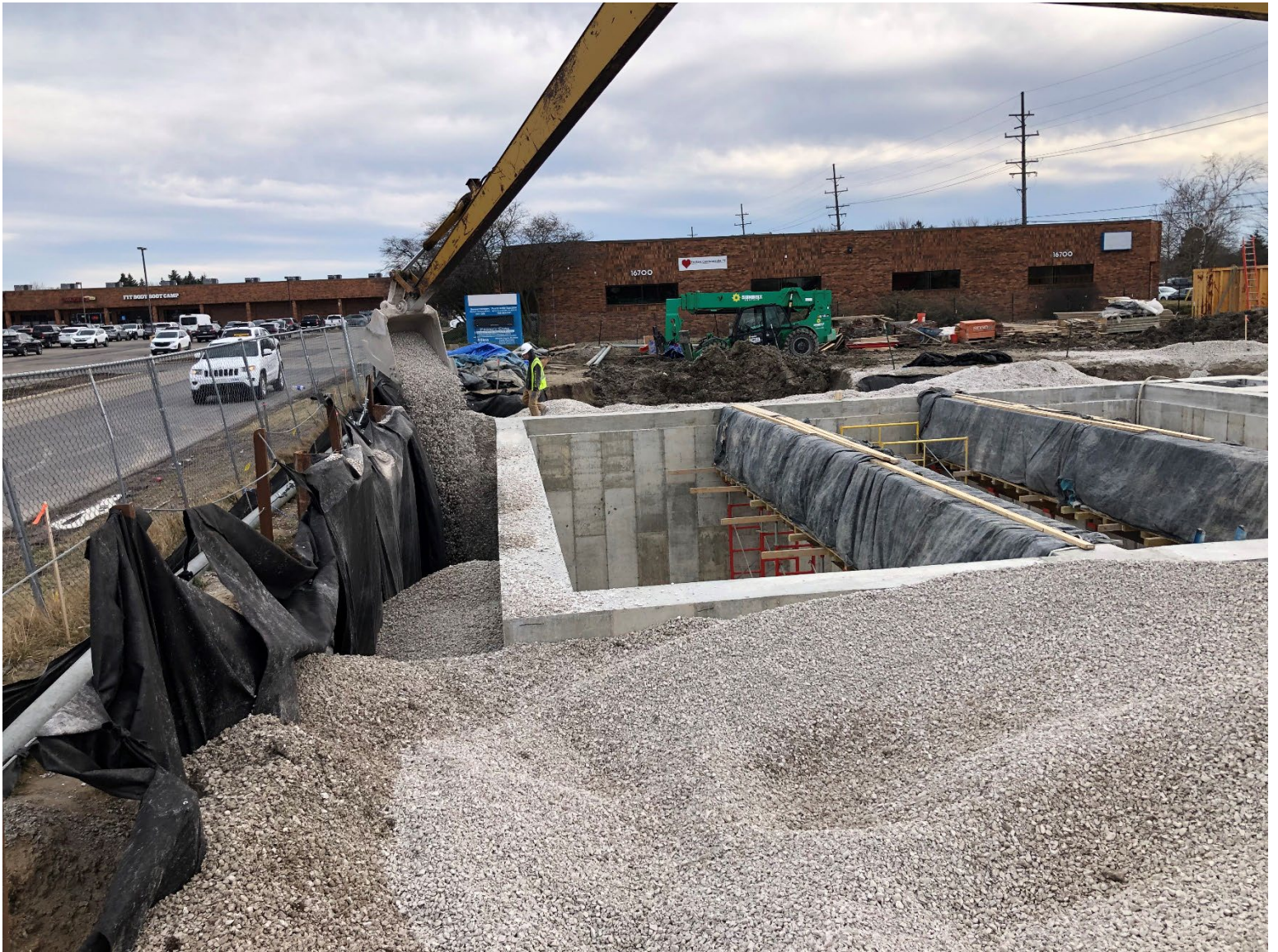
Figure 19 – Macomb Township Bio-Filter Media Backfilling Operations