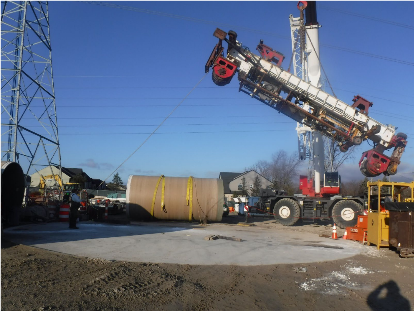
Figure 2 – Hoisting the Pipe Carrier into CS-12 (daily operation for slip-lining)