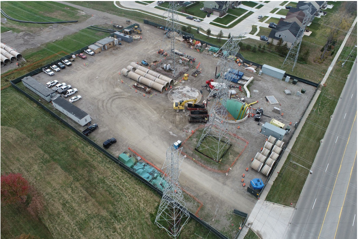
Figure 1 – CS-12 Pump Station, Construction Yard