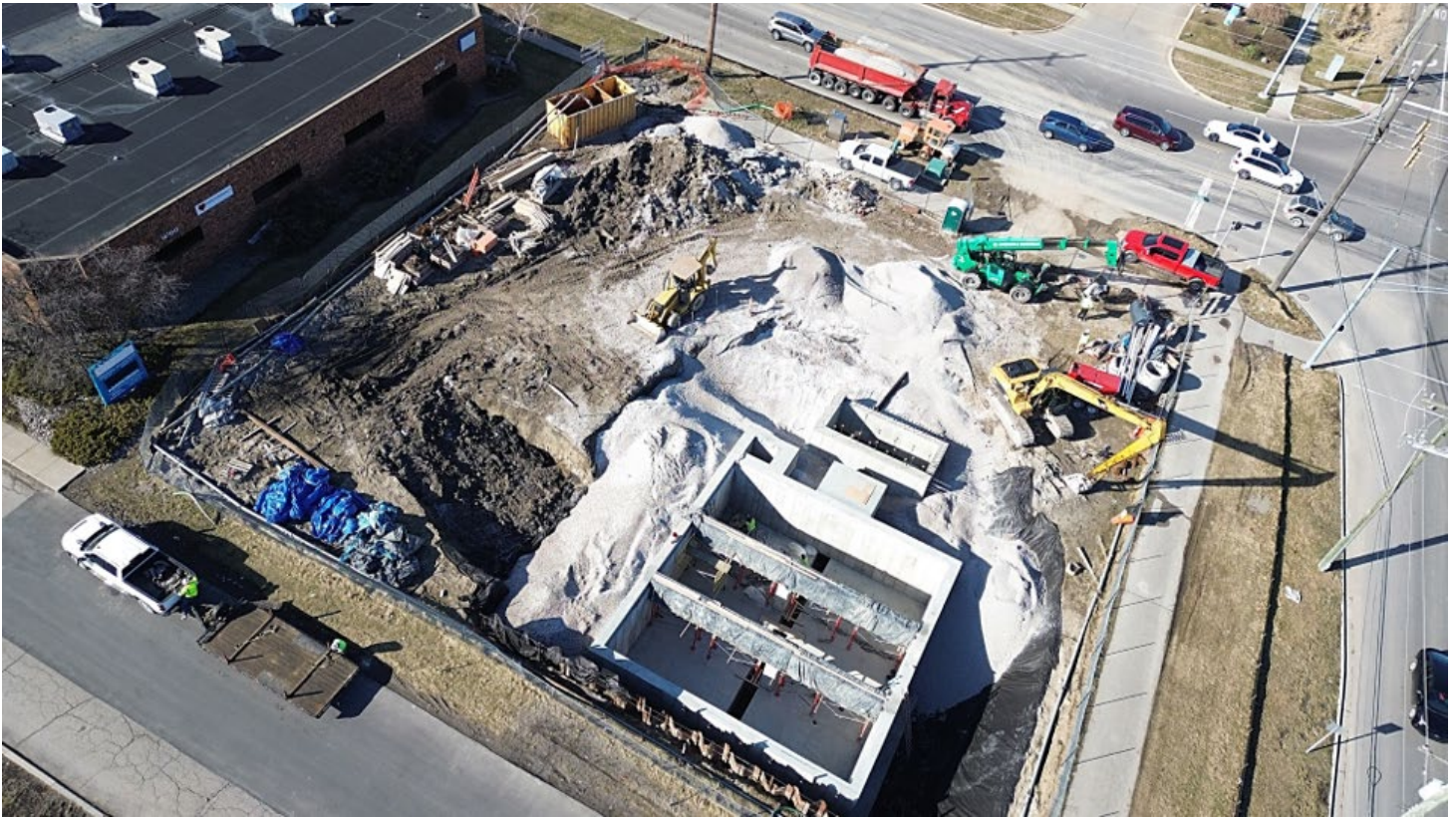
Figure 14 – Aerial View of the Maccomb Twp. Bio-Filter