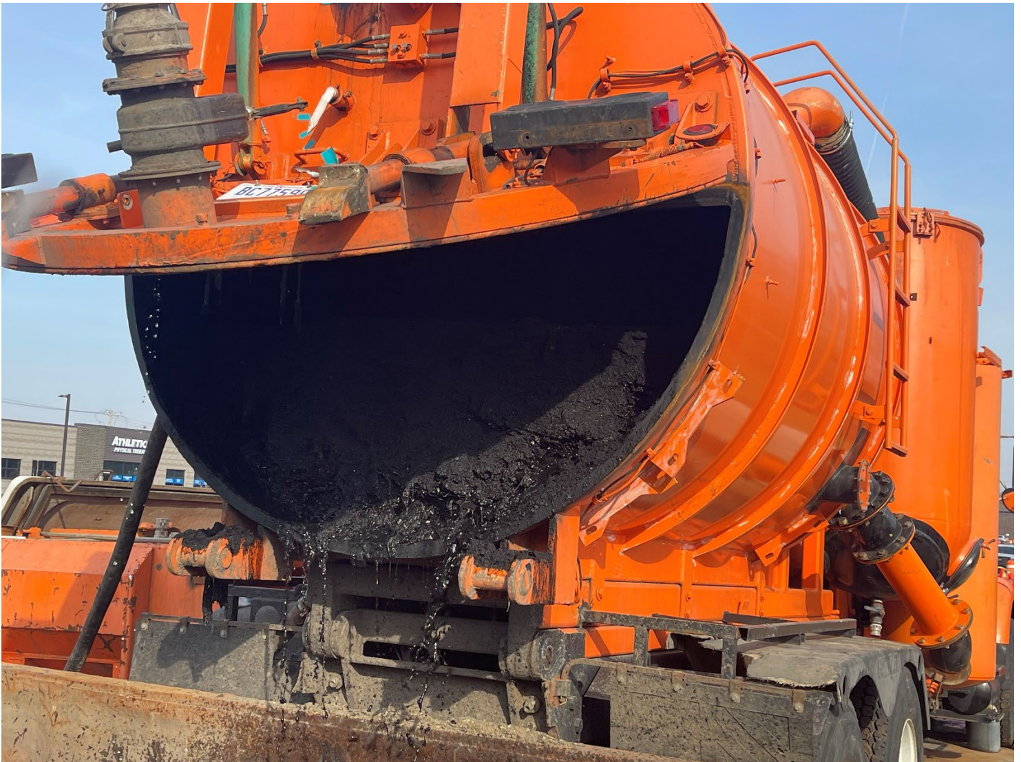
Figure 10 – Emptying Vac-Truck of Debris Removed from Interceptor