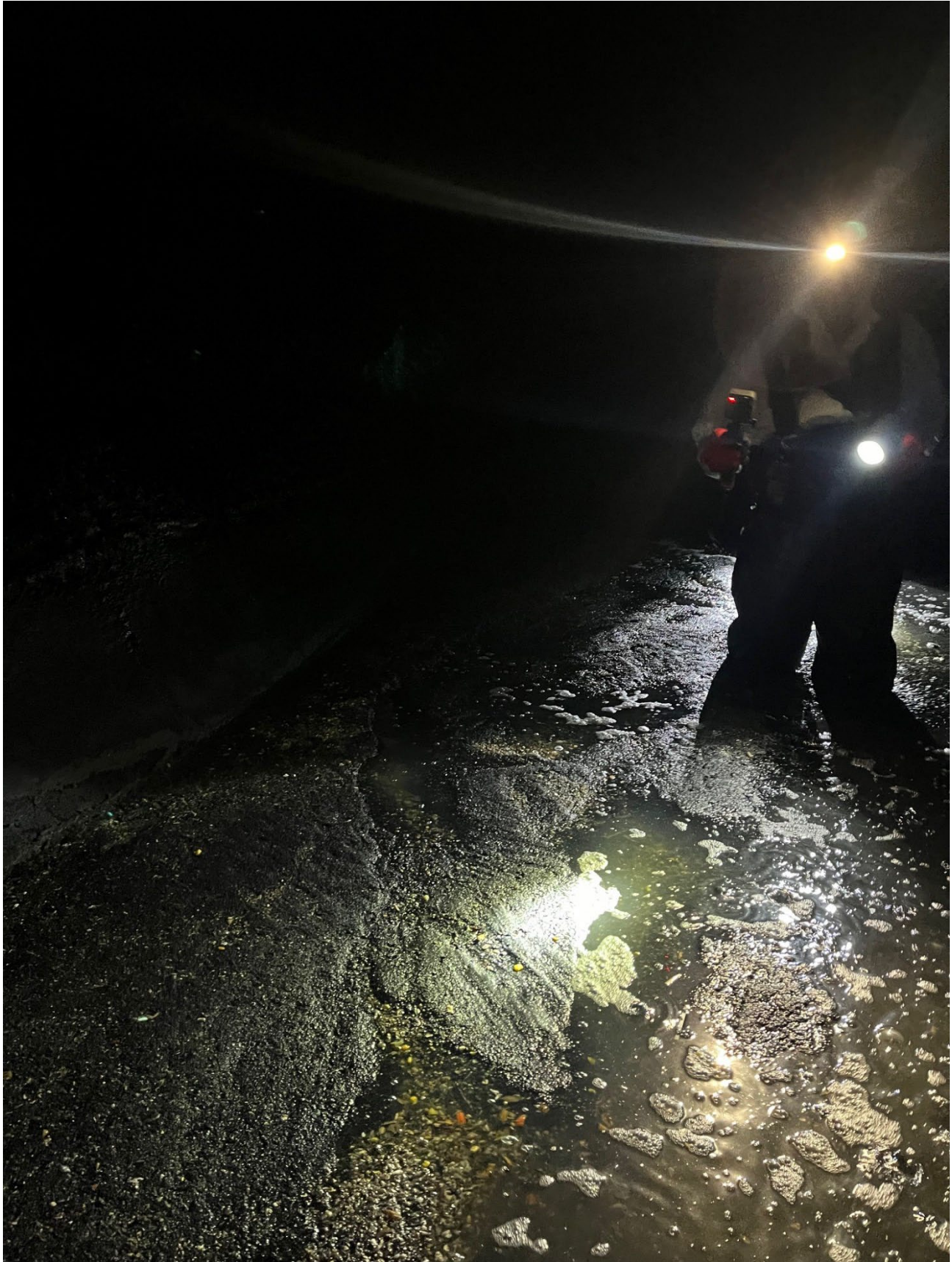
Figure 12 – Heavy Debris & Sludge in the Interceptor