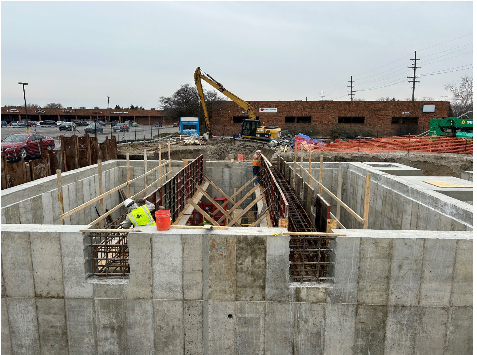
Figure 15 – Macomb Township Bio-Filter Media Chamber Roof Beam Construction