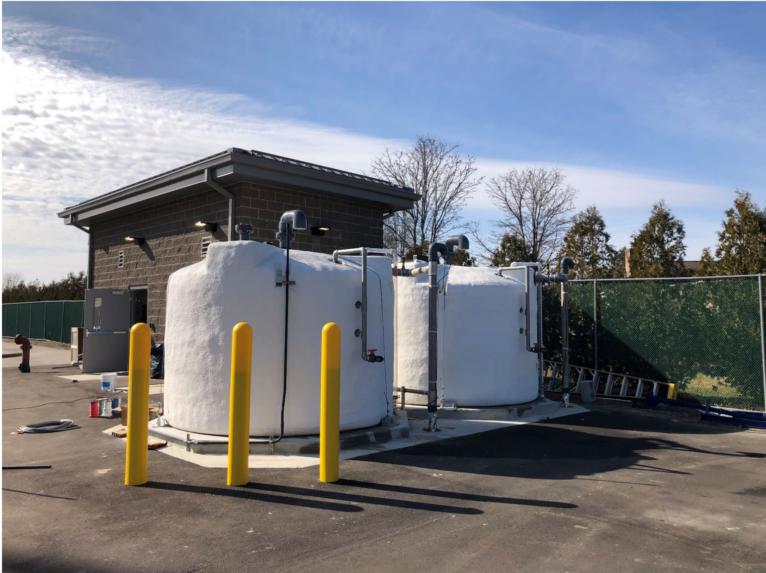
Figure 20 – NGI Chemical Tanks Installed