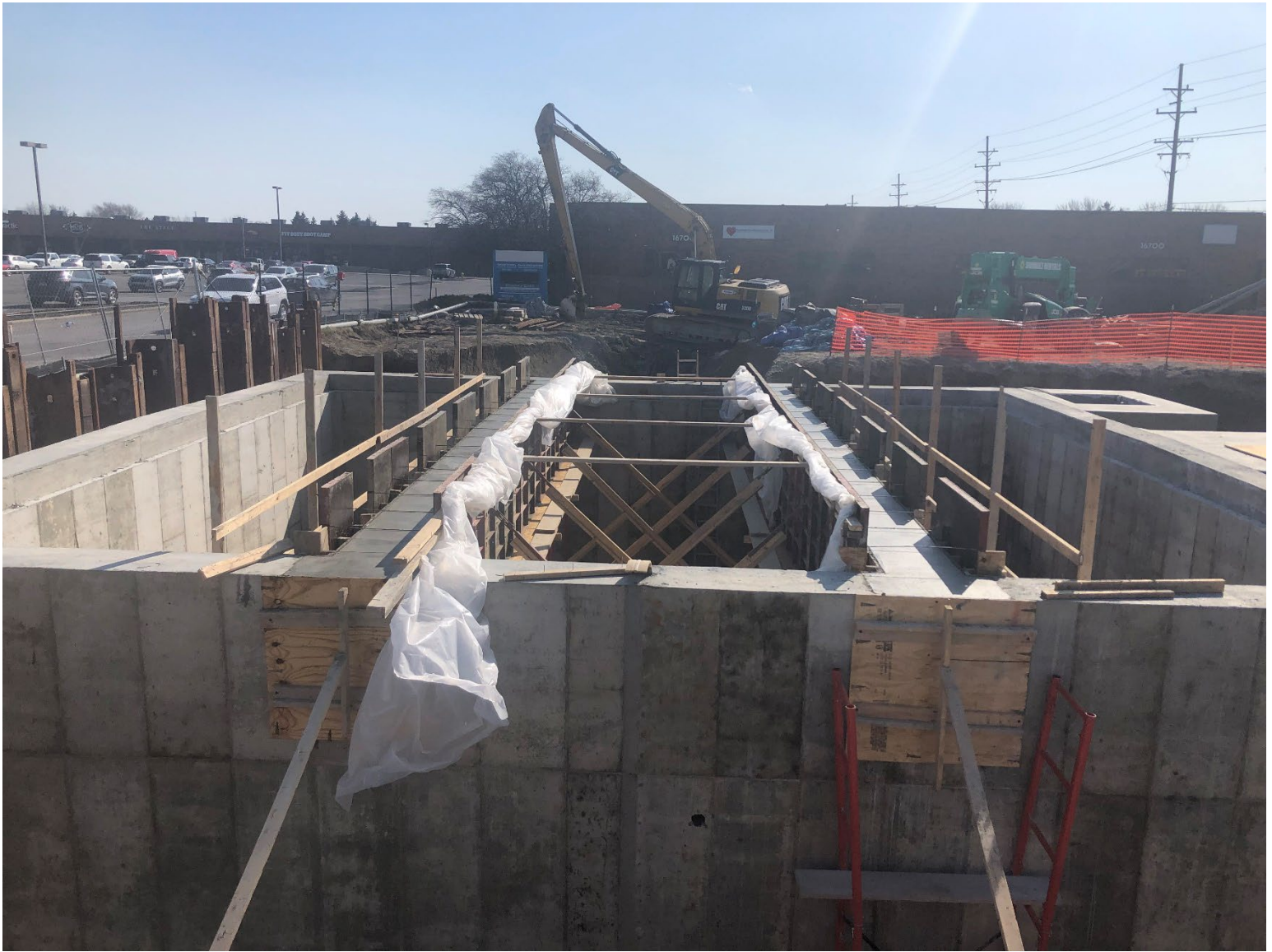
Figure 17 – Macomb Township Bio-Filter Media Chamber Roof Beam Concrete Curing