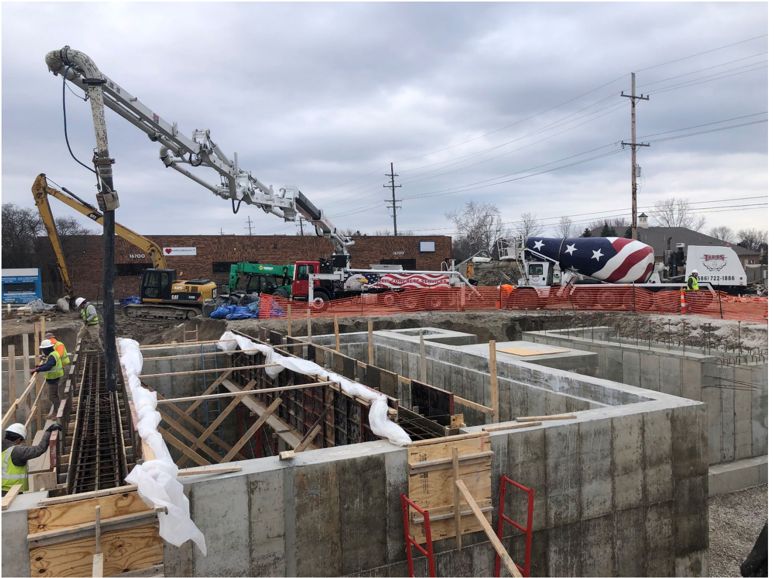
Figure 16 – Macomb Township Bio-Filter Media Chamber Roof Beam Concrete Placement