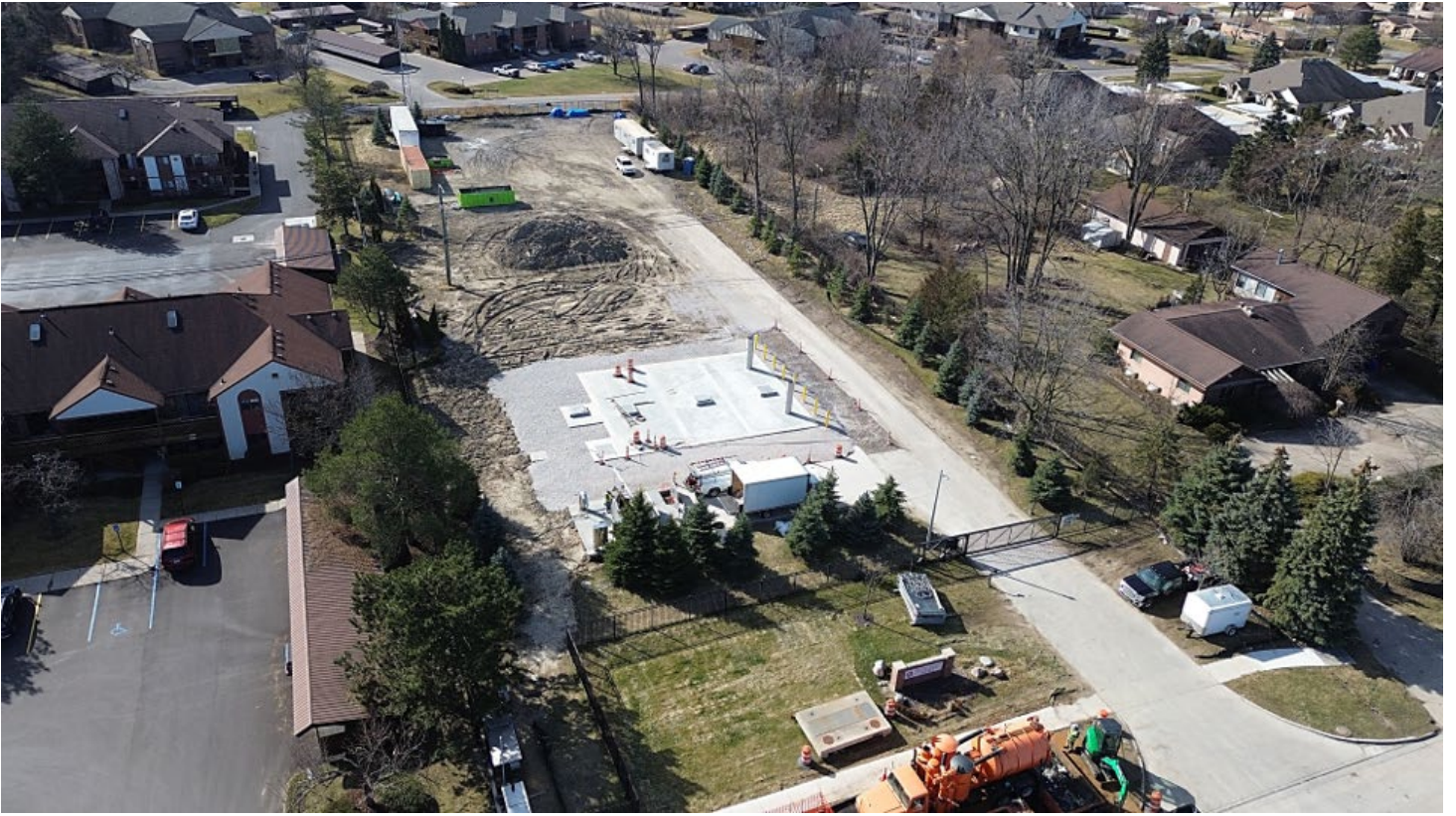
Figure 13 – Aerial View of the Fraser Biofilter