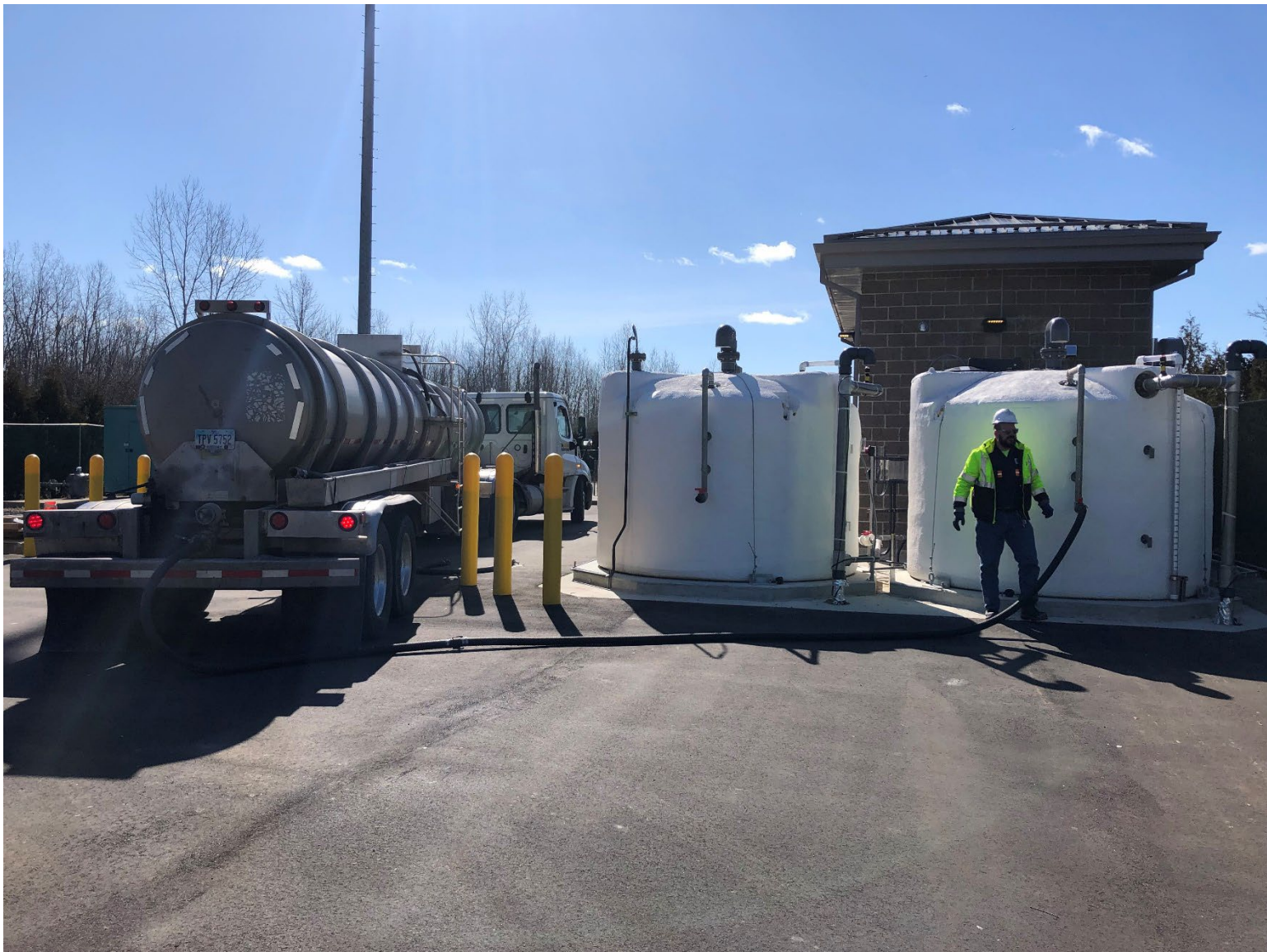
Figure 21 – Initial Filling of the NGI Chemical Tanks