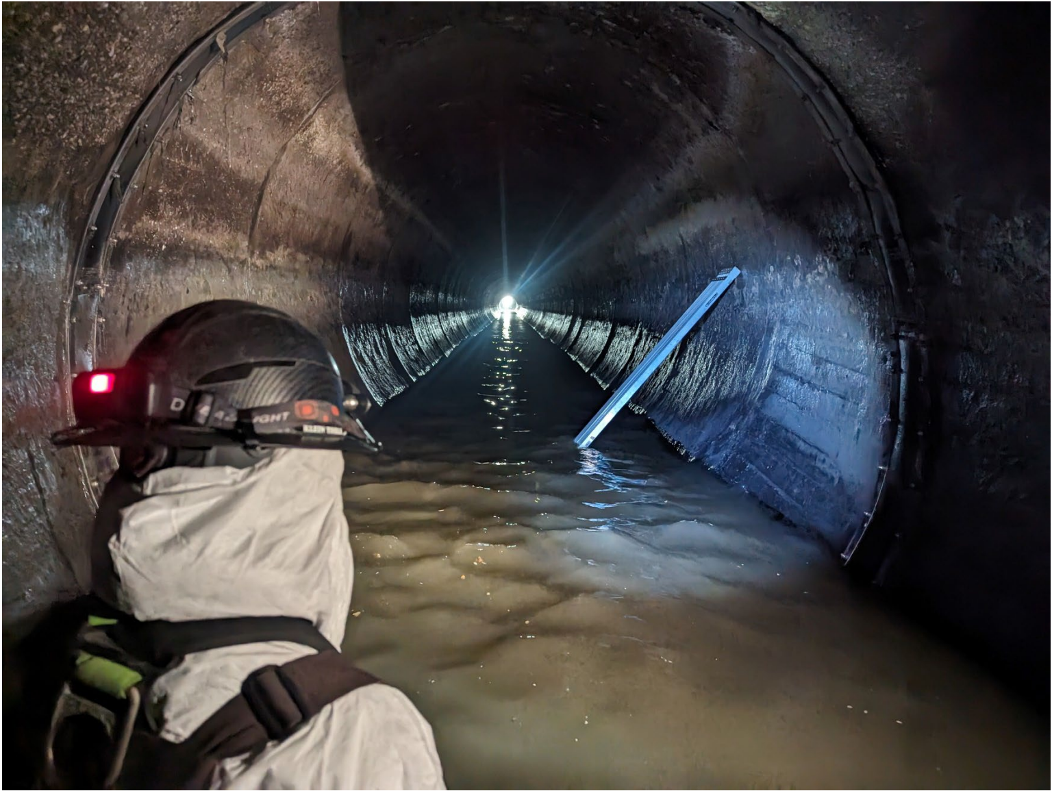
Figure 3 – Transporting the First Section of HOBAS