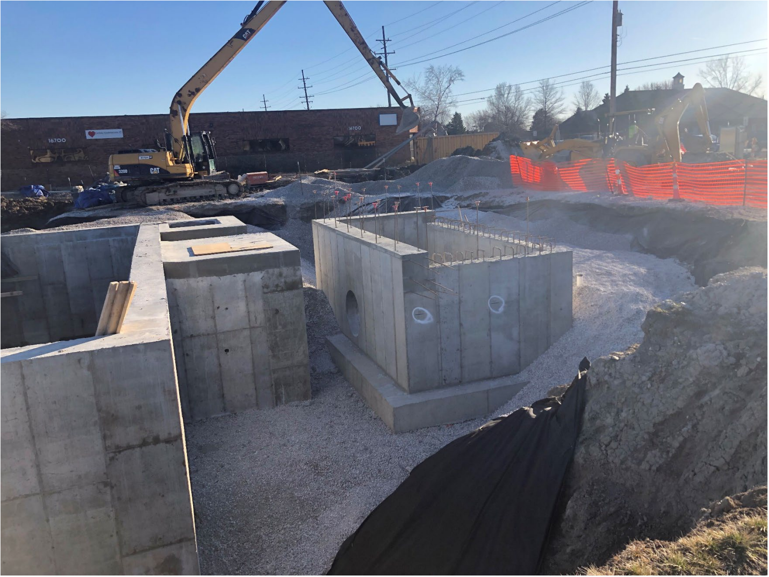
Figure 18 – Macomb Township Bio-Filter Media Backfilling Operations