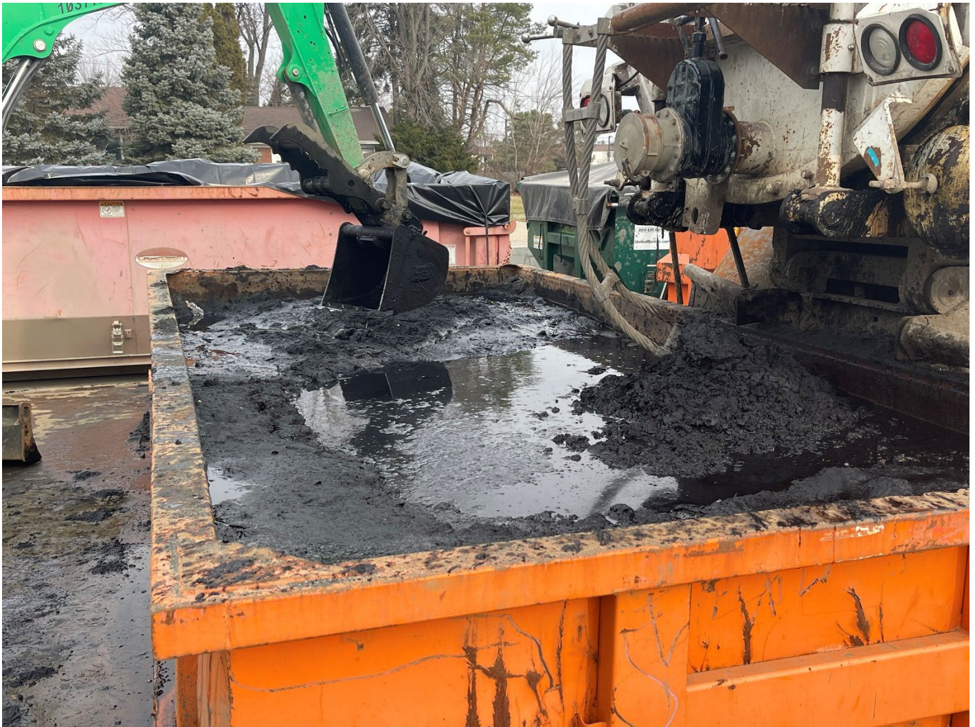
Figure 9 – Debris Removed from Interceptor