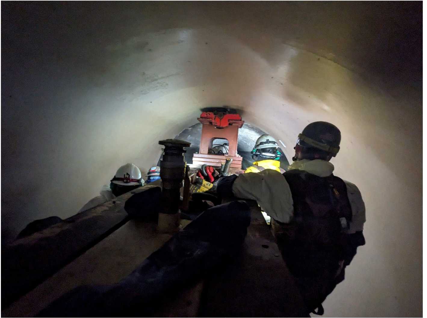
Figure 4 – Riding the Pipe Carrier with HOBAS