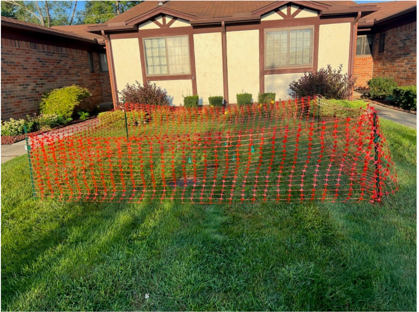
Figure 3 - Temporary Safety Fence Prior to Repairs

OFFICE LOCATION: 21777 Dunham Road, Clinton Township, Michigan 48036 • Phone: 586-469-5325 • Fax: 586-469-5933