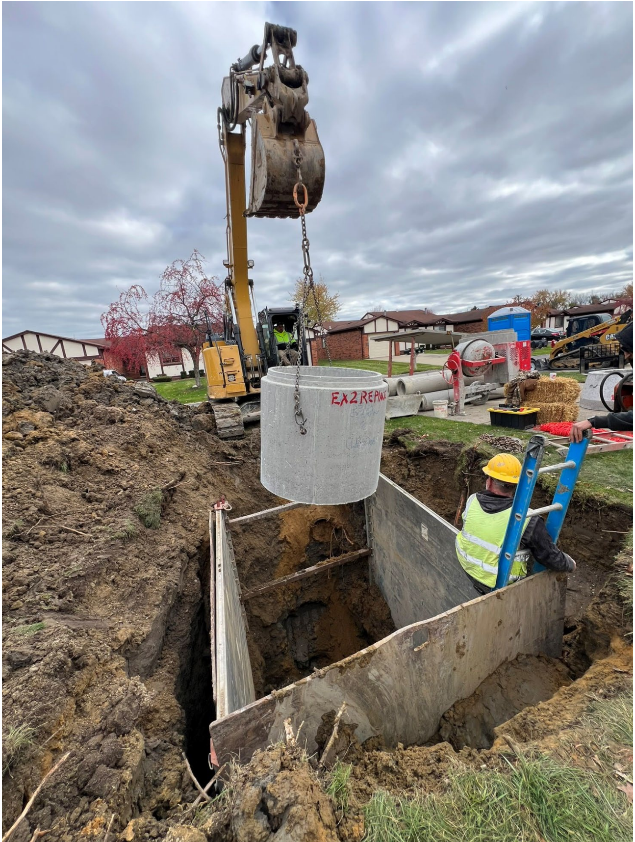
Figure 6 – Installation of New Manhole Structure

OFFICE LOCATION: 21777 Dunham Road, Clinton Township, Michigan 48036 • Phone: 586-469-5325 • Fax: 586-469-5933