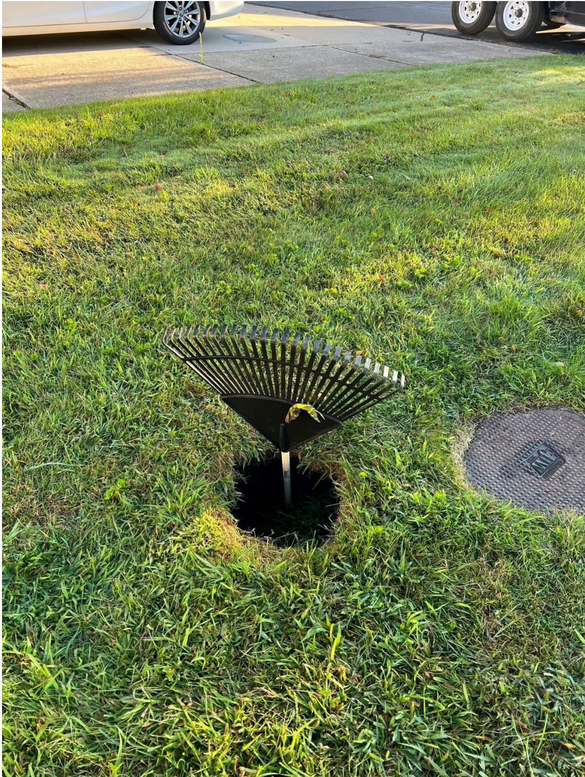
Figure 1 - Sinkhole

OFFICE LOCATION: 21777 Dunham Road, Clinton Township, Michigan 48036 • Phone: 586-469-5325 • Fax: 586-469-5933