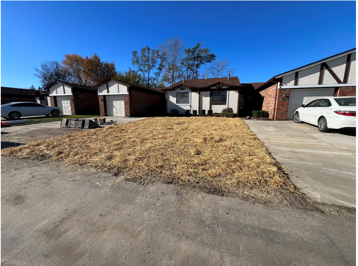
Figure 7 – Site Restoration

OFFICE LOCATION: 21777 Dunham Road, Clinton Township, Michigan 48036 • Phone: 586-469-5325 • Fax: 586-469-5933