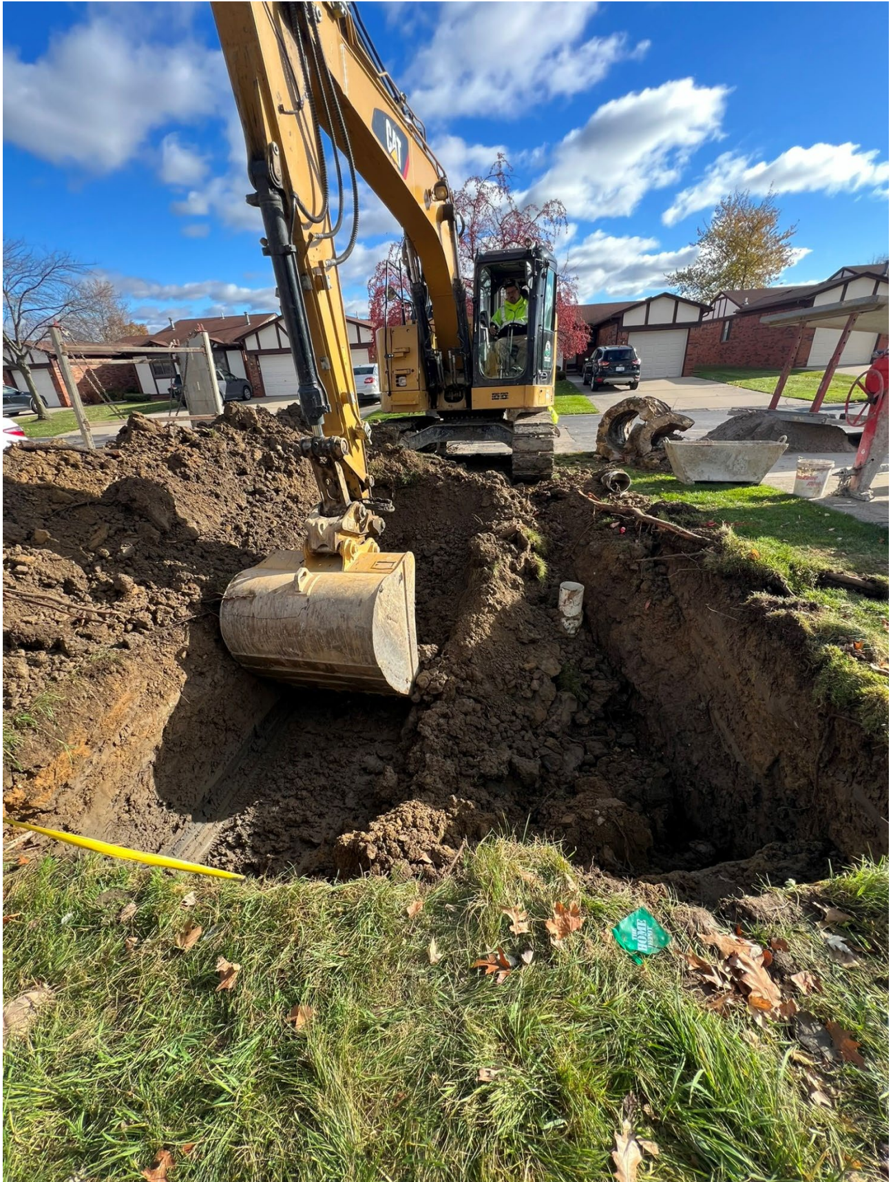
Figure 4 – Excavation for Repair

OFFICE LOCATION: 21777 Dunham Road, Clinton Township, Michigan 48036 • Phone: 586-469-5325 • Fax: 586-469-5933