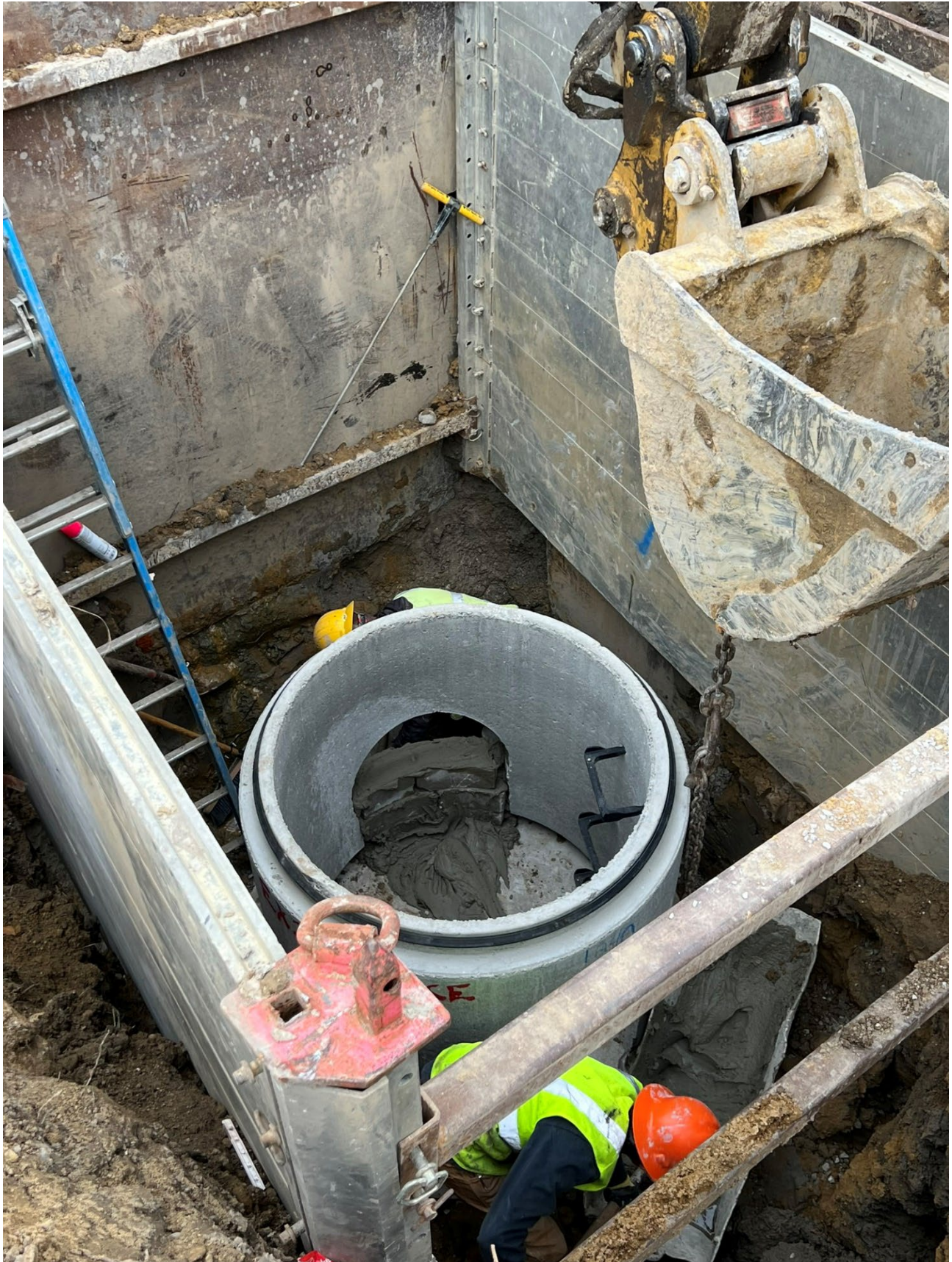
Figure 5 – Installation of New Manhole Structure

OFFICE LOCATION: 21777 Dunham Road, Clinton Township, Michigan 48036 • Phone: 586-469-5325 • Fax: 586-469-5933