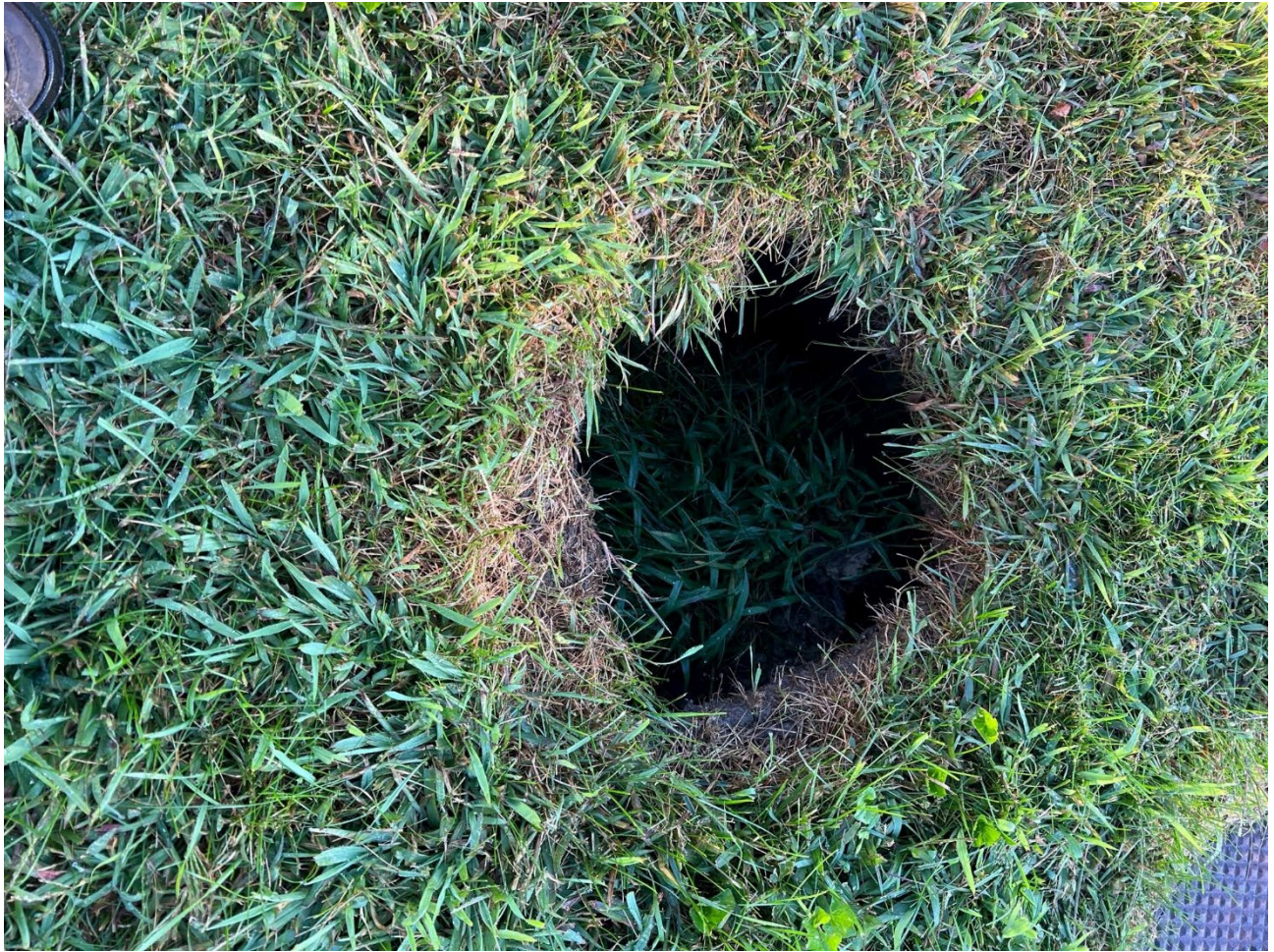
Figure 2 - Sinkhole

OFFICE LOCATION: 21777 Dunham Road, Clinton Township, Michigan 48036 • Phone: 586-469-5325 • Fax: 586-469-5933