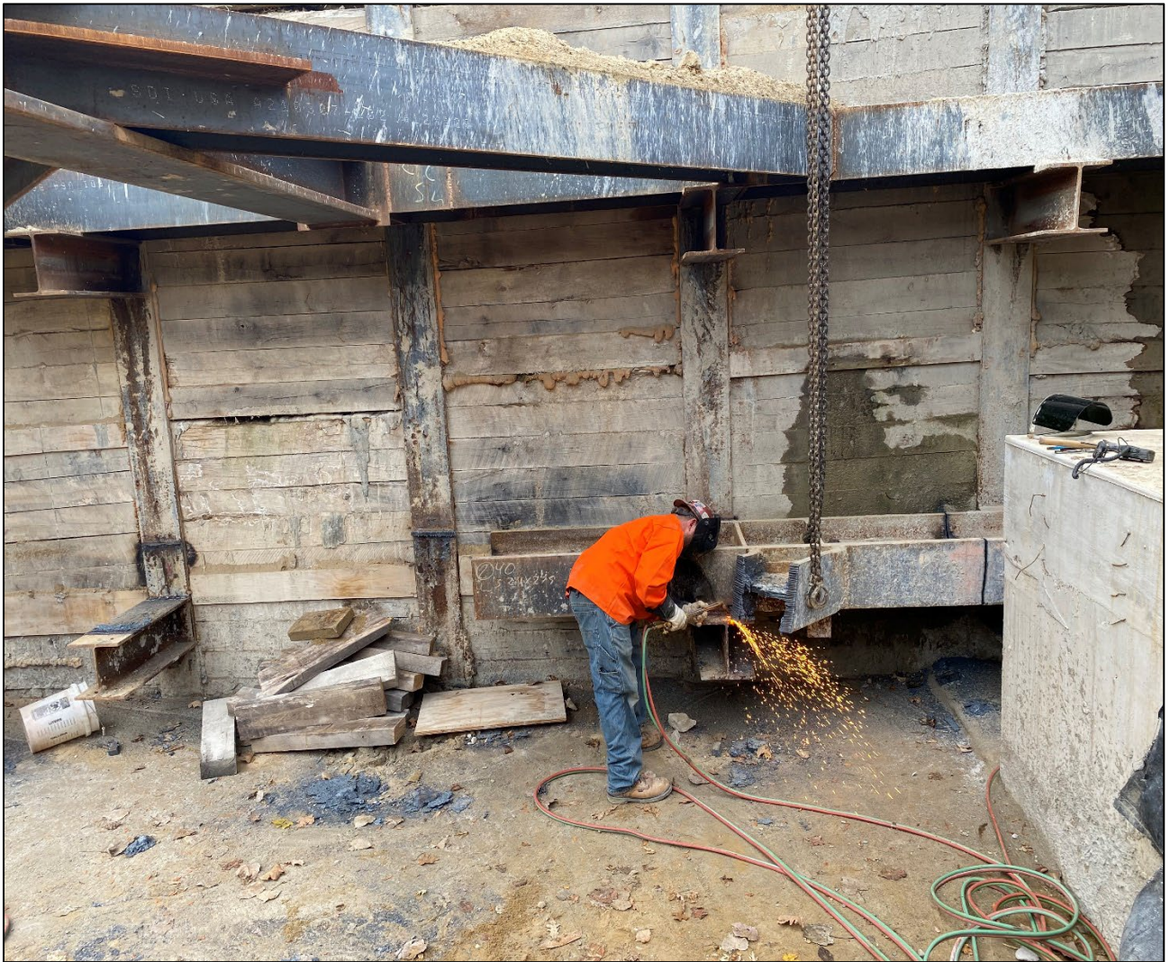
Figure 1 – Removing Steel I-Beams @ Beaconsfield Shaft