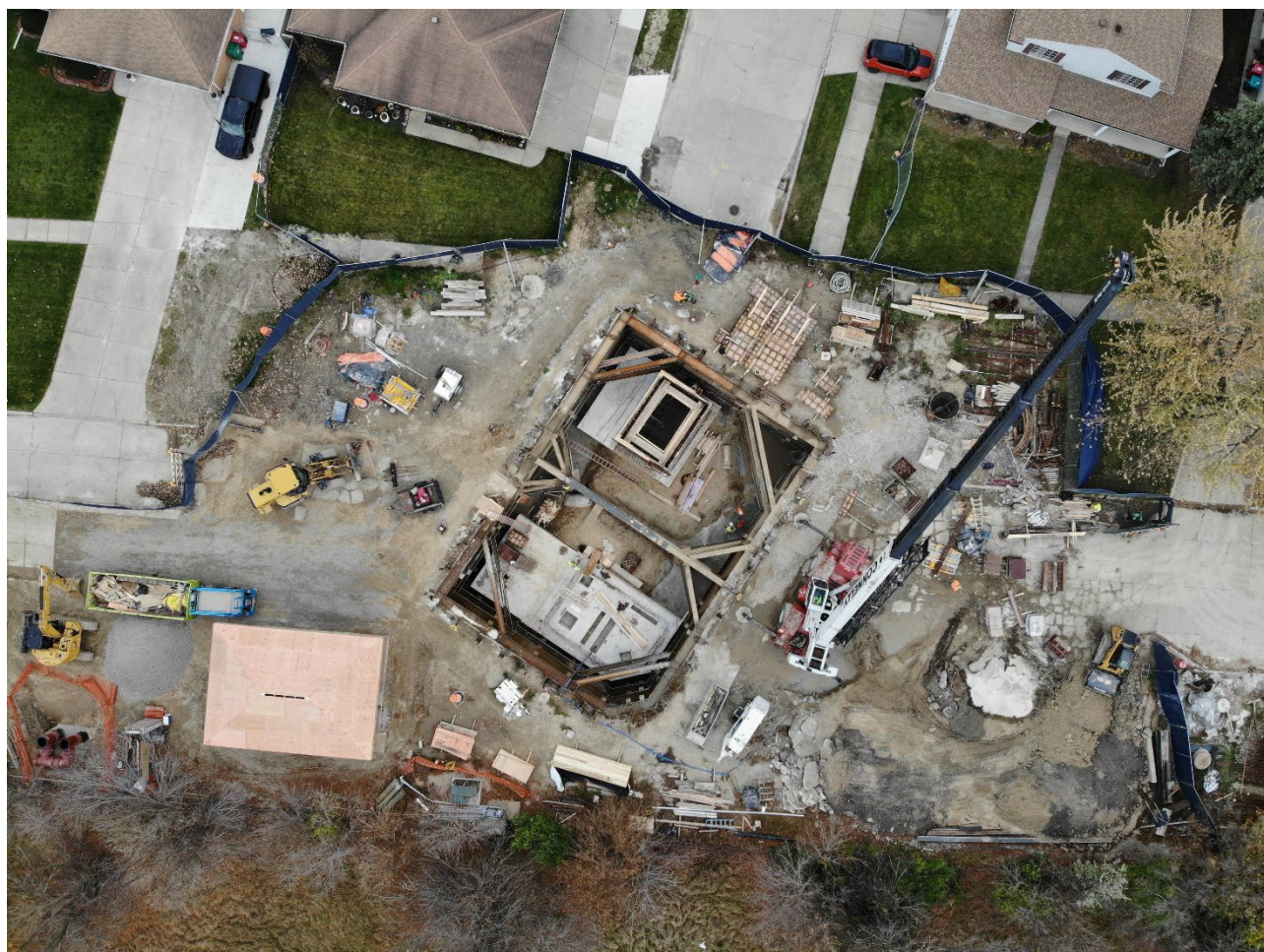
Figure 12 – Drone Aerial at 200 FT