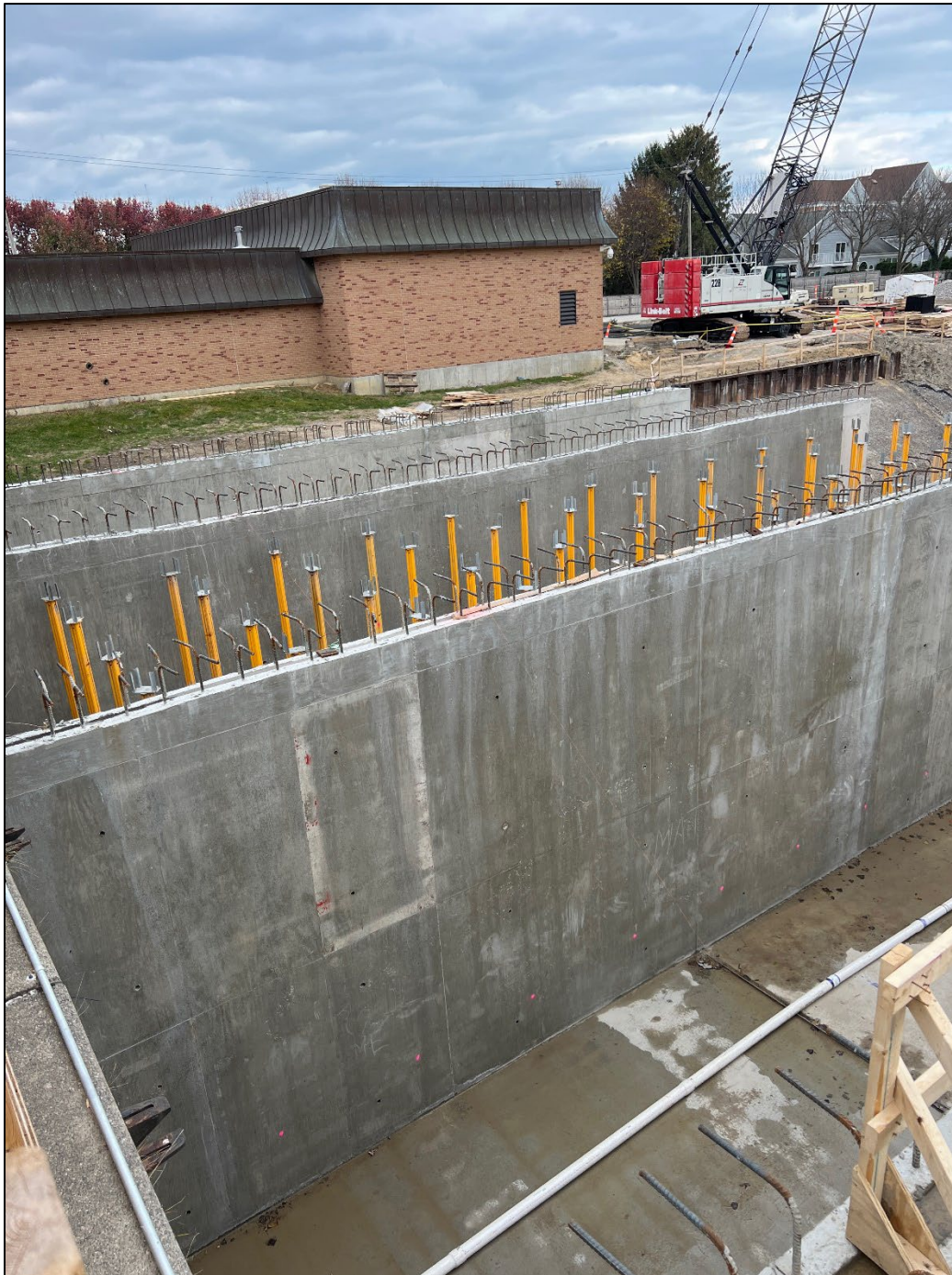
Figure 13 – Screening Structure divider walls, beginning top slab forms