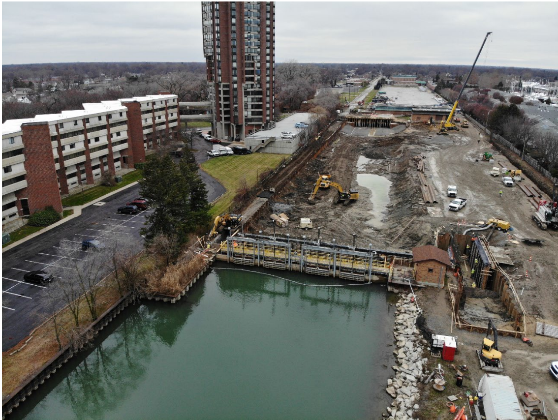
Figure 23 – Drone Aerial at 100 FT Facing West (12/04/23)