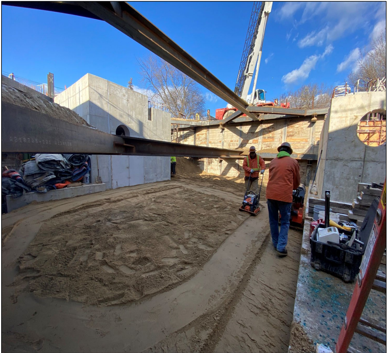
Figure 7 – Compacting Sand Backfill @ Beaconsfield Shaft