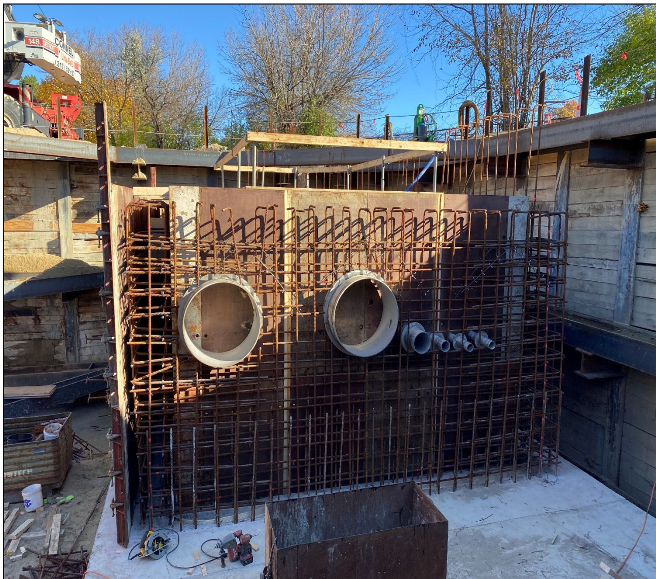
Figure 5 – Embedded Thimbles for Vent Pipe @ Beaconsfield Shaft