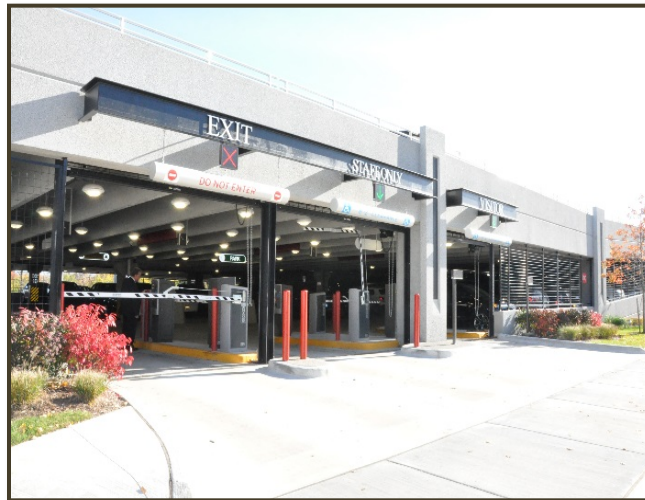
Parking structure southbound Main St

PARK AND RIDE - You can park and ride a shuttle bus through Mount Clemens Dial a Ride for $1 each way that will drop you off on North Main Street between the Court and County Buildings. The shuttle bus parking lot is located on North River Road (across from "Clinton River Cruises").