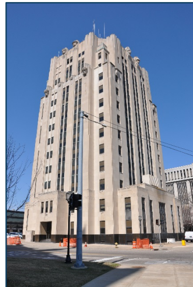
Old County Building

The Macomb County Friend of the Court is located on the 1 st through 7 th Floors of the Old County Building which is at 10 North Main Street, Mount Clemens, Michigan 48043. All visitors must enter the building at the Main St side or via the basement level tunnel from the Court Building or the Administration Building. If you park in the parking garage you will enter the Administration Building and can walk the basement tunnel to the Old County Building. Please check in with reception on the 2 nd floor unless you are only coming in to make a payment. Payments may be made on the 1 st floor at the Cashiers Office.