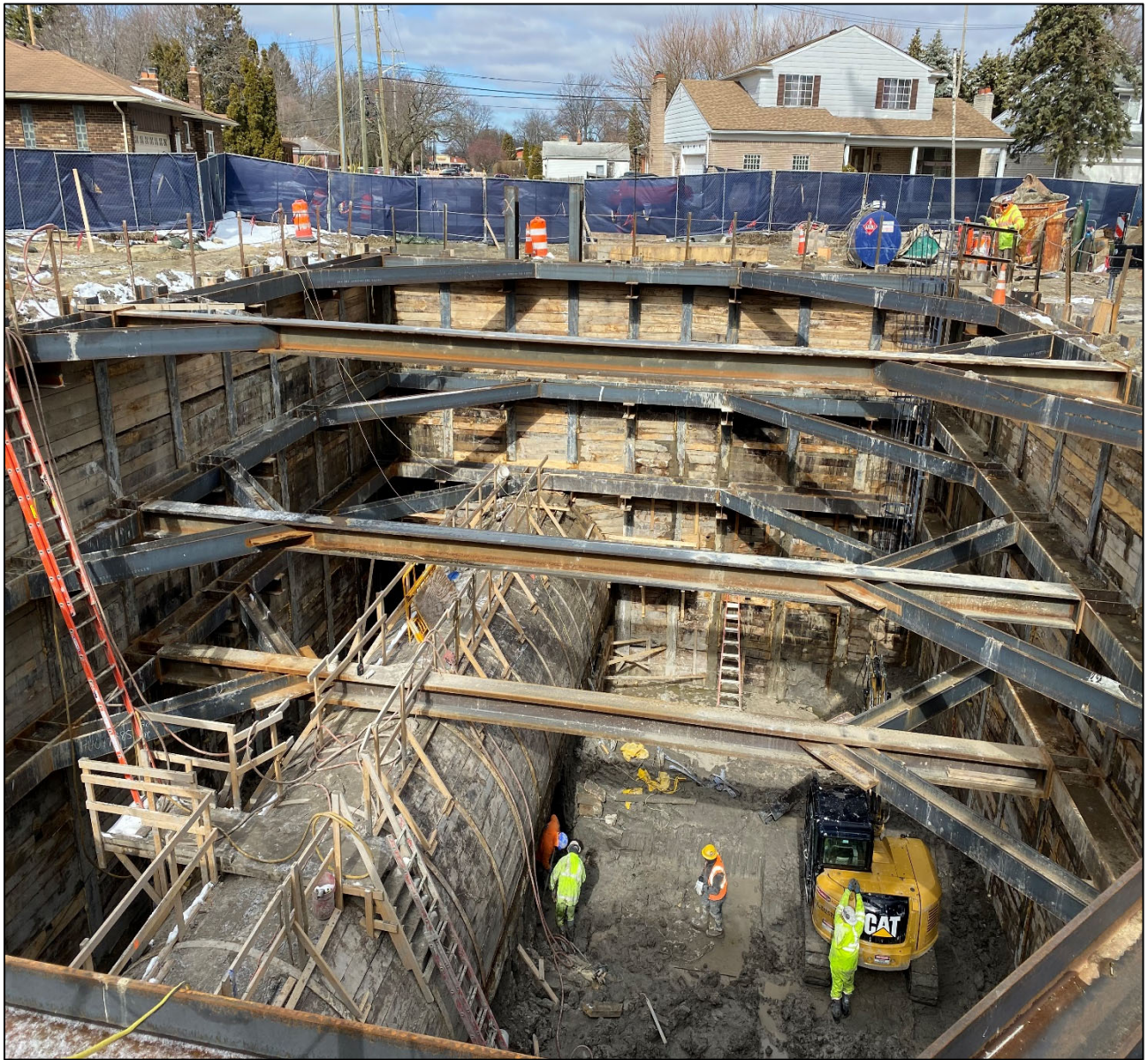
Figure 1 – Beaconsfield Shaft Facing West

OFFICE LOCATION: 21777 Dunham Road, Clinton Township, Michigan 48036 • Phone: 586-469-5325 • Fax: 586-469-5933 ENGINEERING • Phone: 586-469-5910 • Fax: 586-469-7693 ♦ SOIL EROSION • Phone: 586-469-5327 • Fax 586-307-8264