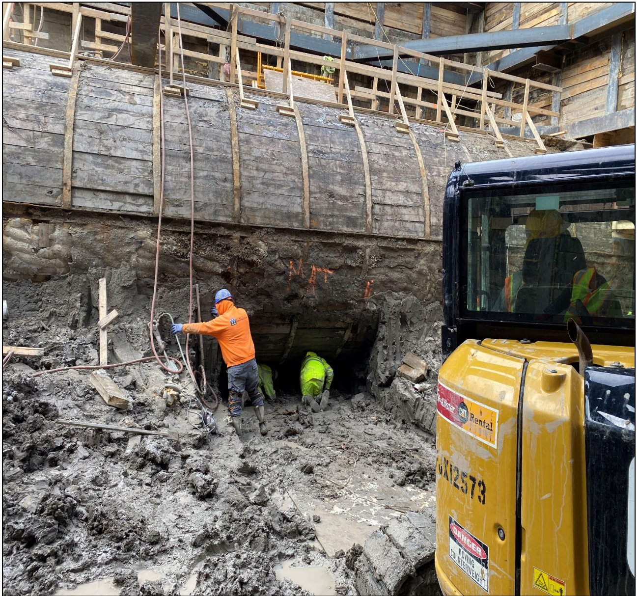
Figure 2 – Excavating Under Tunnel