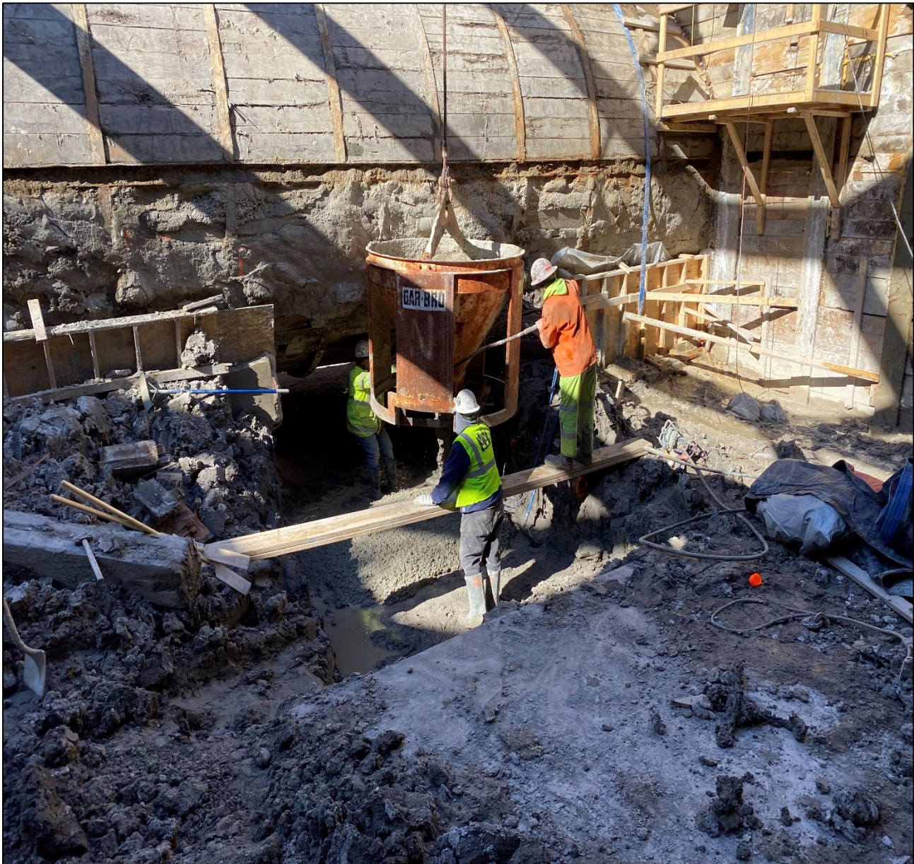
Figure 6 – Placing Low Strength Concrete Mat