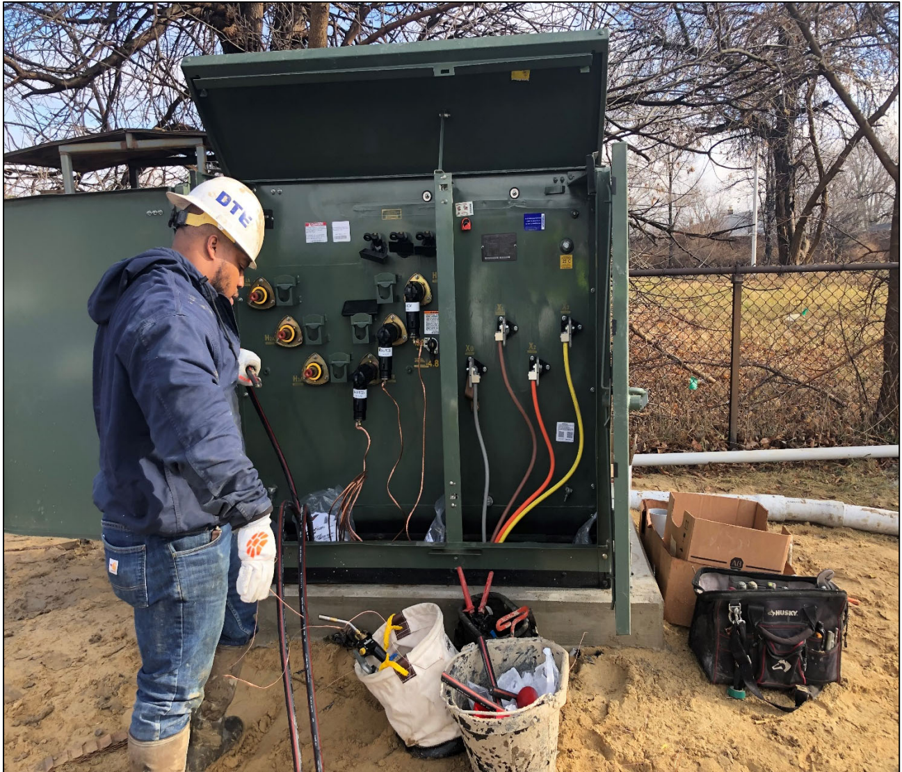
Figure 6 – DTE Energizing Transformer