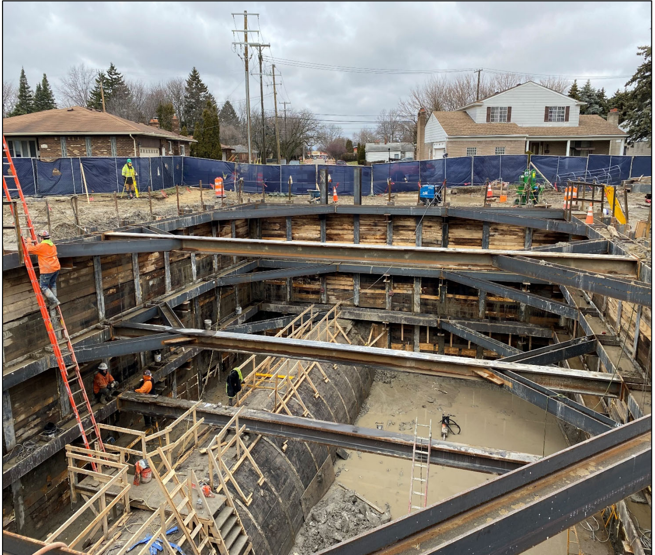
Figure 4 – Excavated Approx. 25FT Facing West