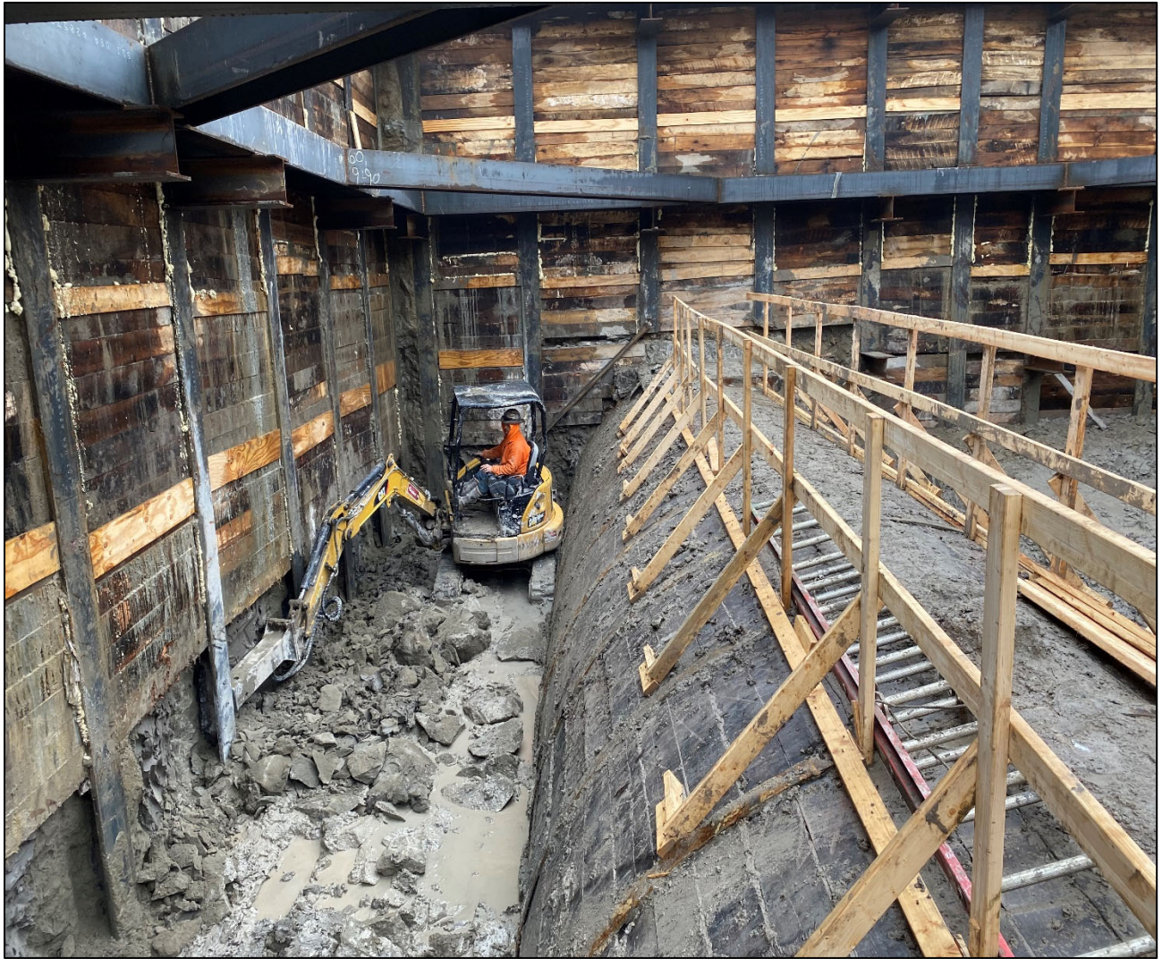
Figure 1 – Chipping Grout from Drilled Piers