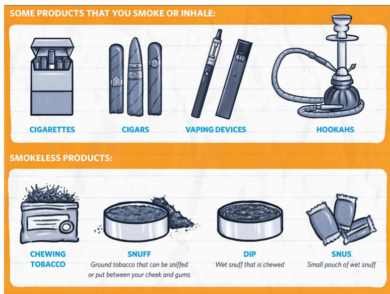
Image source: National Institute on Drug Abuse. Mind matters: the body's response to nicotine, tobacco and vaping. Accessed March 15, 2021. https://teens.drugabuse.gov/teachers/mind-matters/nicotine