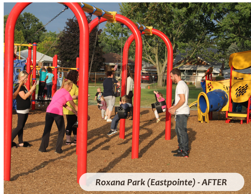
Roxana Park (Eastpointe) - AFTER