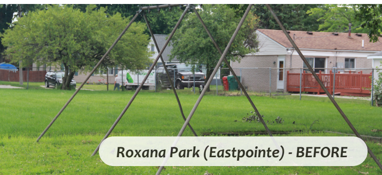
Roxana Park (Eastpointe) - BEFORE

At the onset of the Covid-19 pandemic, MCA Transportation was on the front line providing service to homebound Meals on Wheels recipients. To reduce the number of individuals involved in the delivery process, volunteer driver routes were reassigned to MCA Transportation routes. This doubled the number of routes we had prior to the pandemic and more than doubled the number of meals served on each route. Through the coordination of the Office of Senior Services and other County Departments, the Meals on Wheels program continued to run seamlessly with the help of the many volunteers who delivered most of the meals prior to the pandemic.