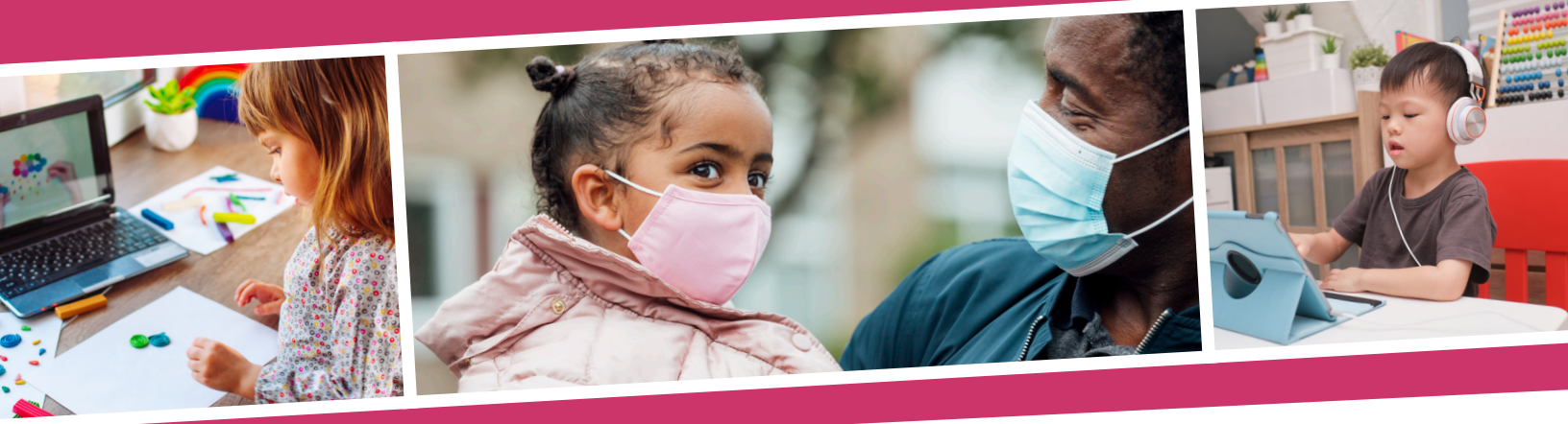
Early Head Start 0 - 3 ♦ School Readiness Goals 2019-20