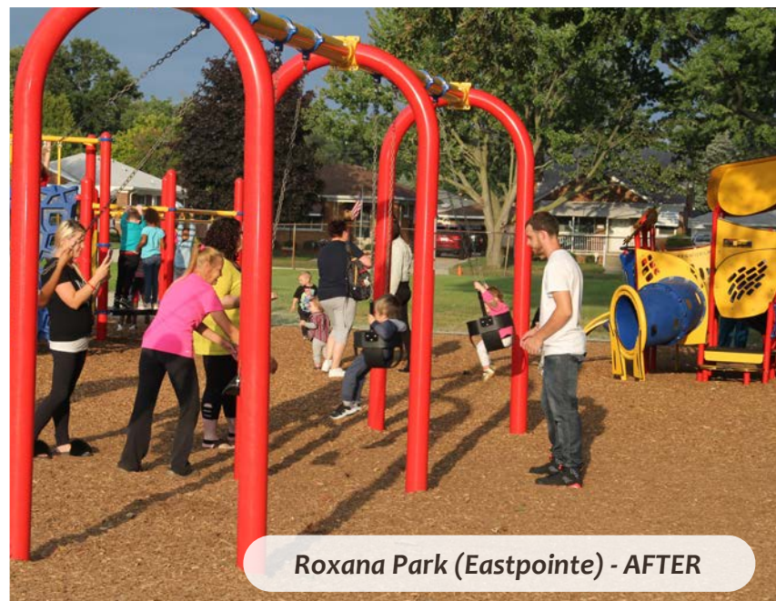
Roxana Park (Eastpointe) - AFTER