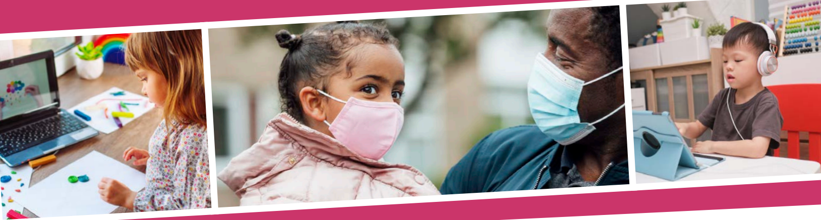
Early Head Start 0 - 3 ♦ School Readiness Goals 2019-20