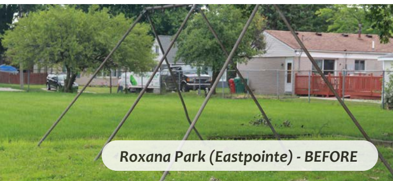
Roxana Park (Eastpointe) - BEFORE

At the onset of the Covid-19 pandemic, MCA Transportation was on the front line providing service to homebound Meals on Wheels recipients. To reduce the number of individuals involved in the delivery process, volunteer driver routes were reassigned to MCA Transportation routes. This doubled the number of routes we had prior to the pandemic and more than doubled the number of meals served on each route. Through the coordination of the Office of Senior Services and other County Departments, the Meals on Wheels program continued to run seamlessly with the help of the many volunteers who delivered most of the meals prior to the pandemic.